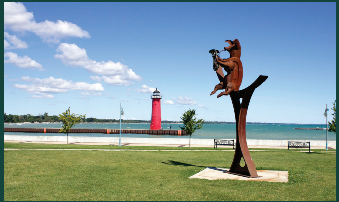
Lighthouse & Sculptures