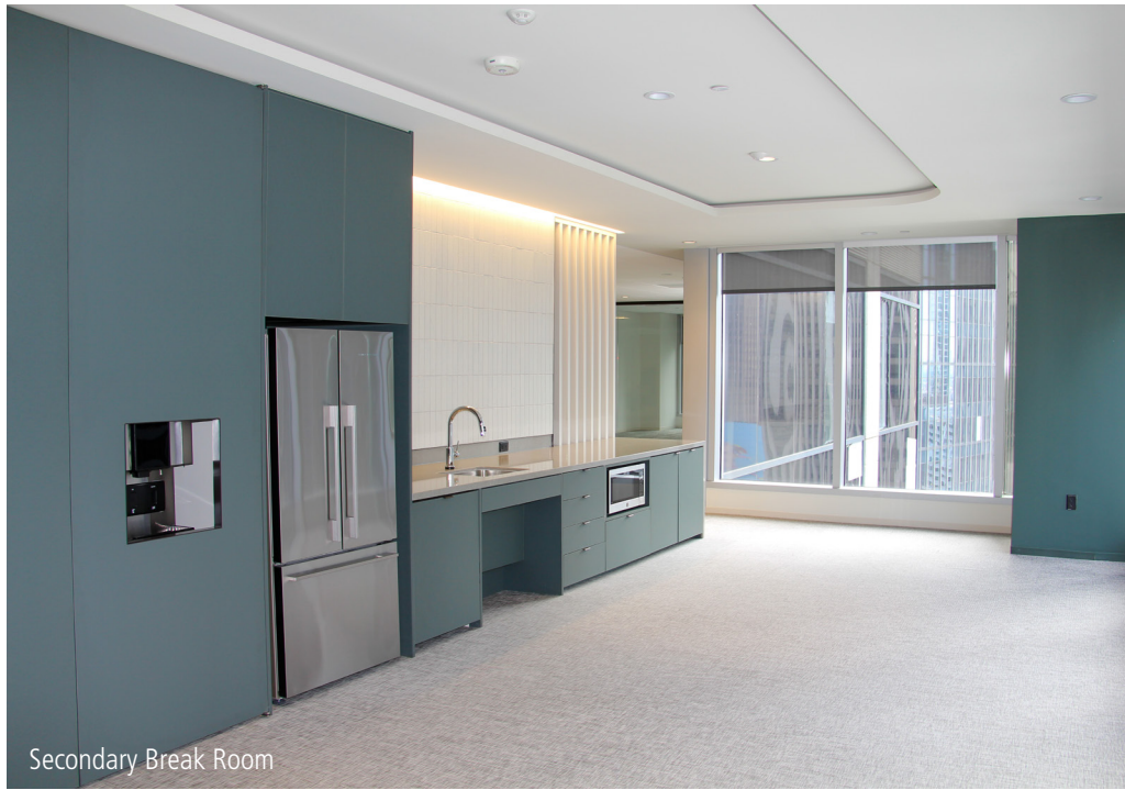
Secondary Break Room