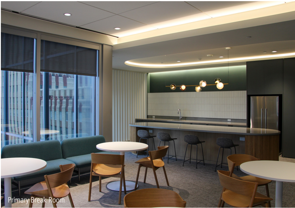
Primary Break Room