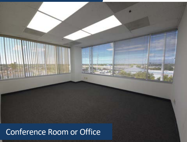
Conference Room or Office