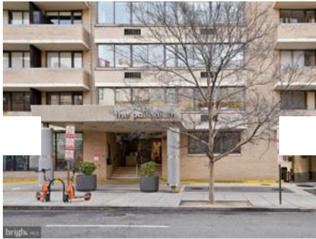
1 / 26 The Palladium on 18th St NW