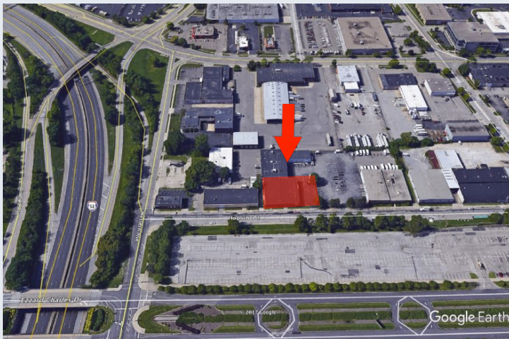
View from North