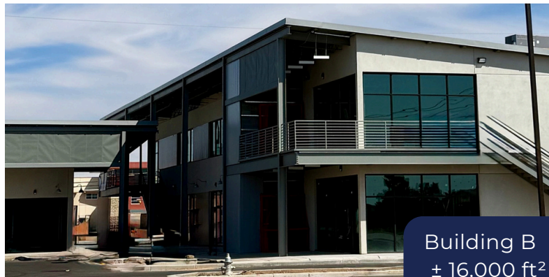
Building B ± 16,000 ft 2