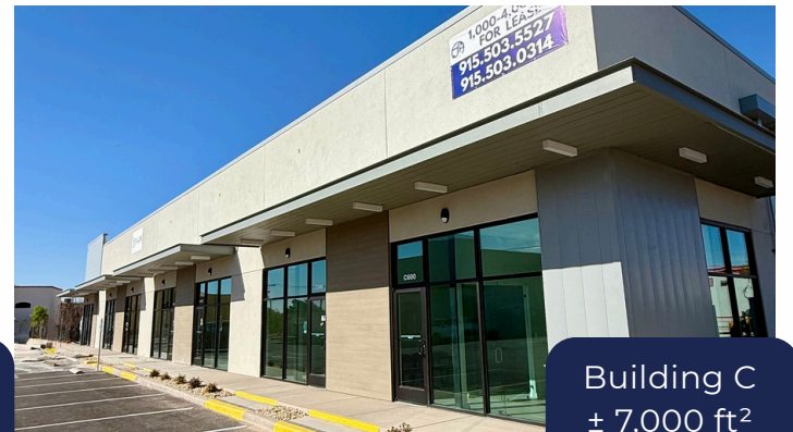
Building C ± 7,000 ft 2