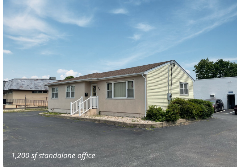
1,200 sf standalone office