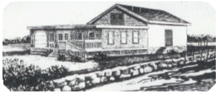
Drawing of Gardner's Wharf Seafood

Looking west across harbor entrance with Gardner's Wharf in the foreground