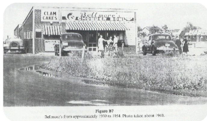
Figure B7 c) 1939 to 1954. Photo taken about 1940.

The following photos depict the changes and different views of longstanding Gardner's Wharf and its use as a seafood market and shellfish processing station over the years.