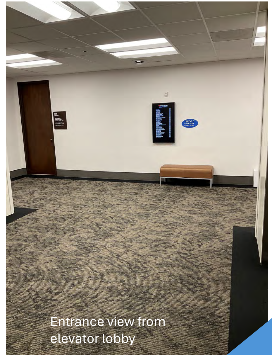
Entrance view from elevator lobby