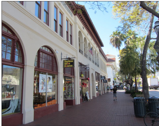
02 – 627 State Street.