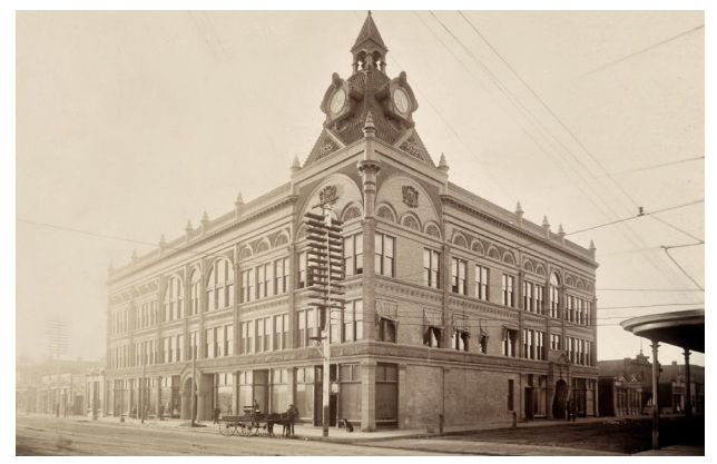
01 – Fithian Building historical photo.