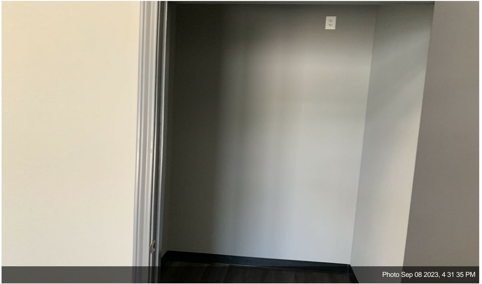
Photo Sep 08 2023, 4 31 35 PM