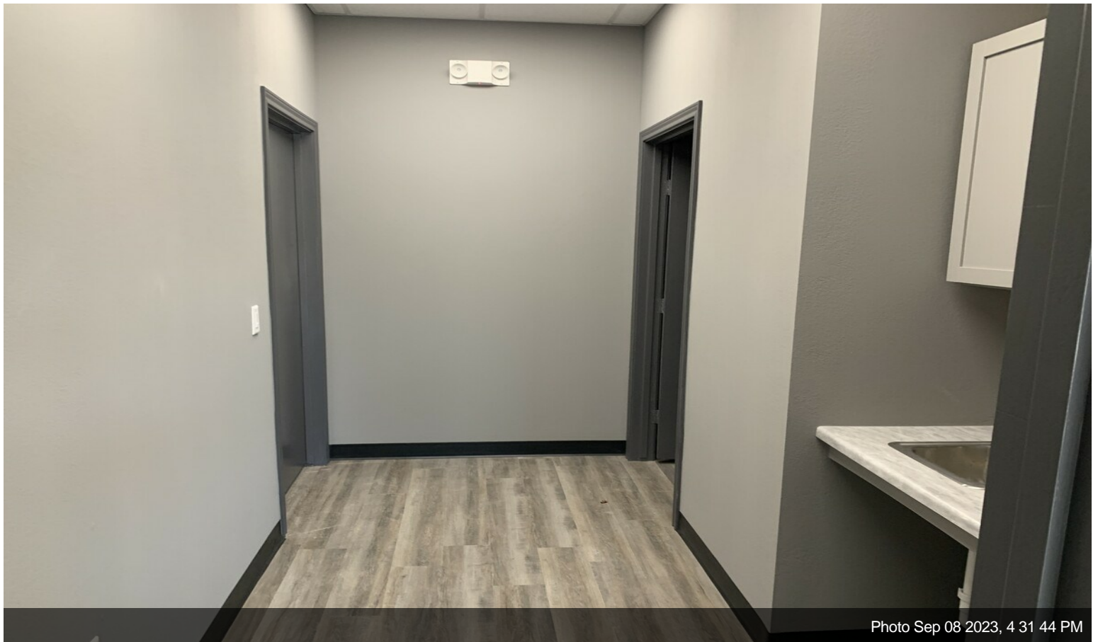
Photo Sep 08 2023, 4 31 44 PM