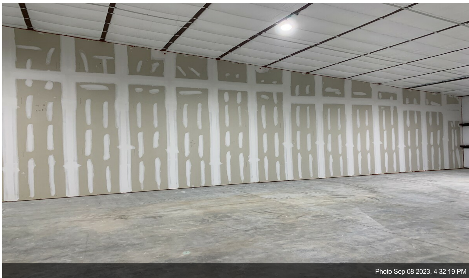
Photo Sep 08 2023, 4 32 19 PM