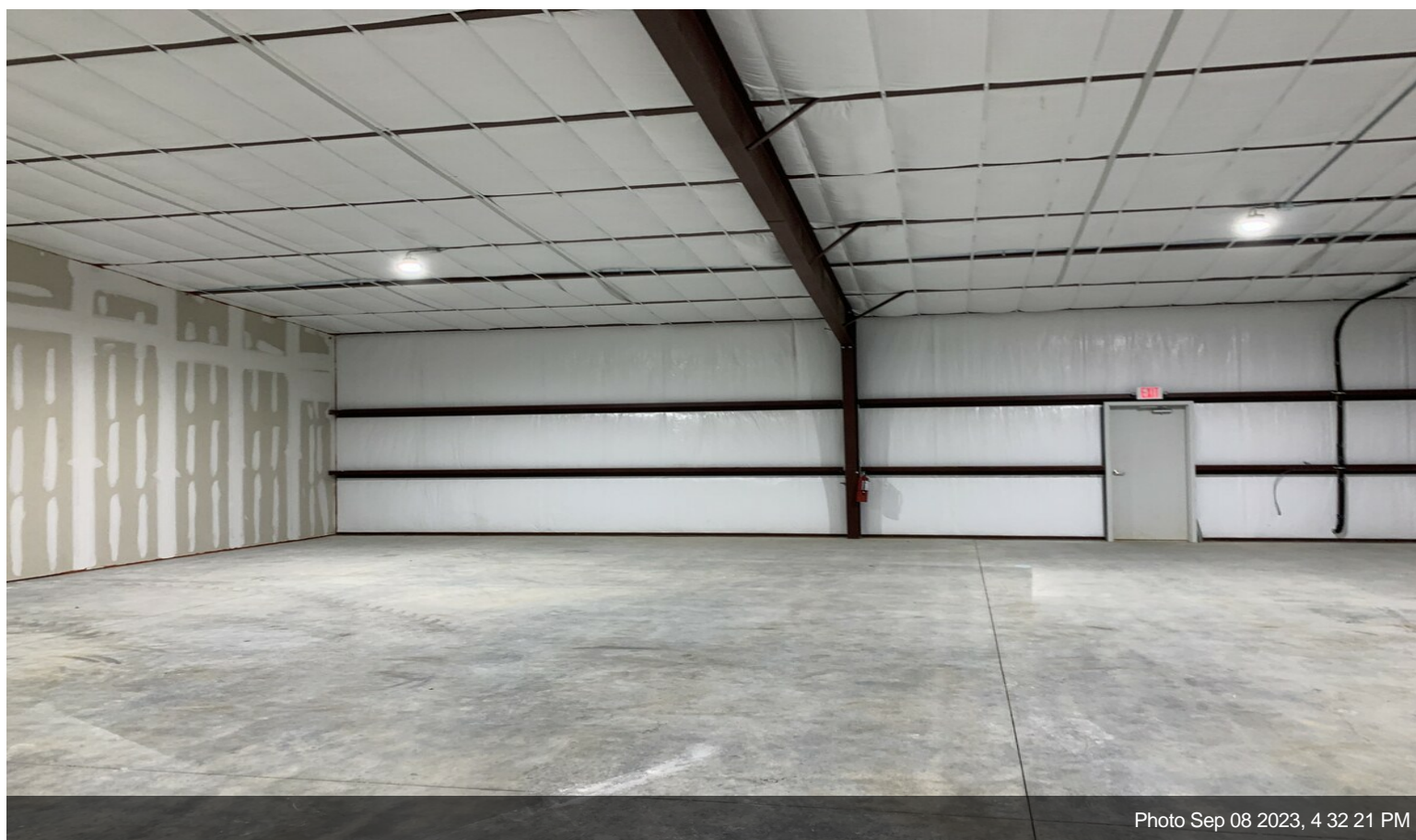
Photo Sep 08 2023, 4 32 21 PM