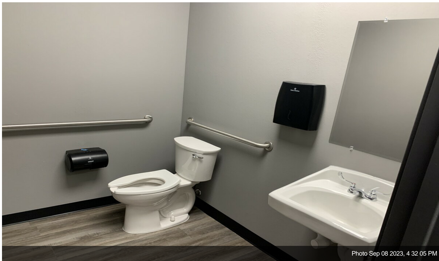
Photo Sep 08 2023, 4 32 05 PM