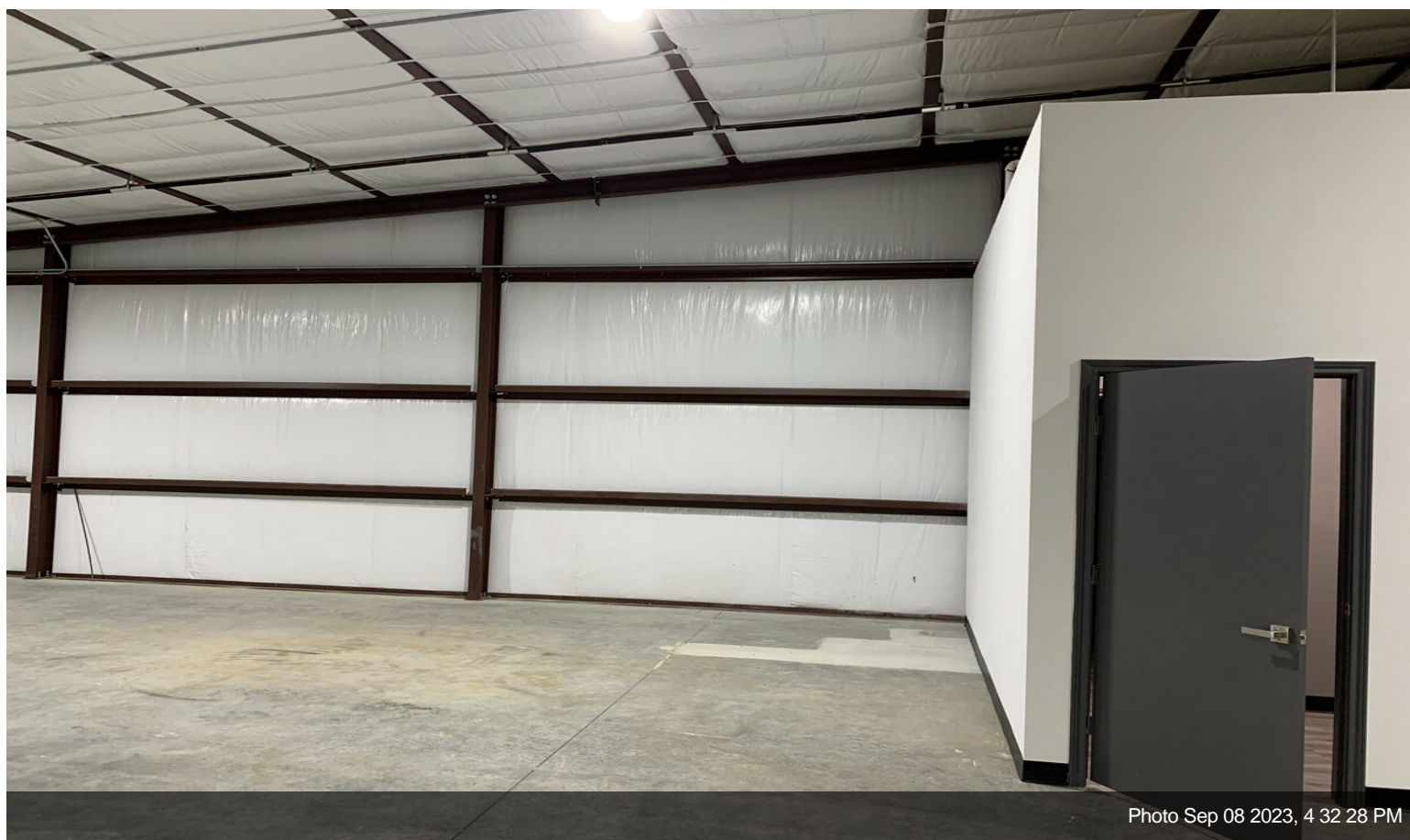
Photo Sep 08 2023, 4 32 28 PM