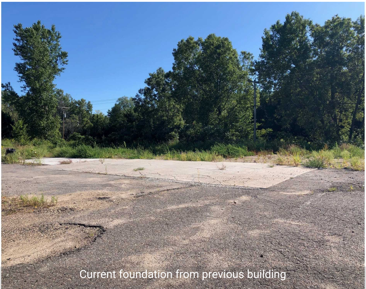
Current foundation from previous building