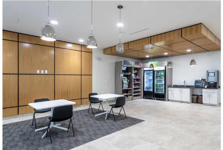
Breakroom & Market of University Commerce Center