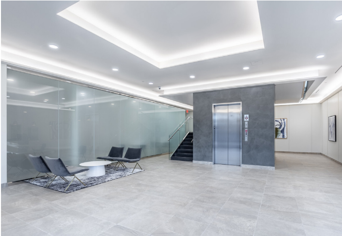
Lobby of University Commerce Center

44921 George Washington Boulevard, Ashburn VA 20147