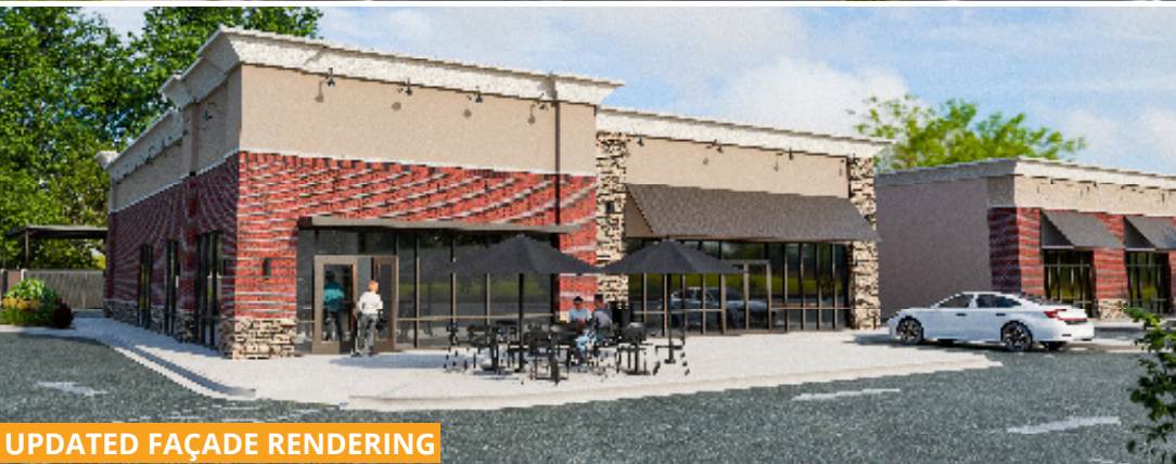
UPDATED FAÇADE RENDERING