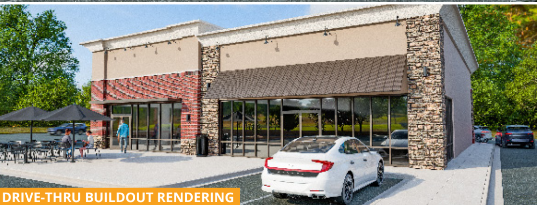
DRIVE-THRU BUILDOUT RENDERING