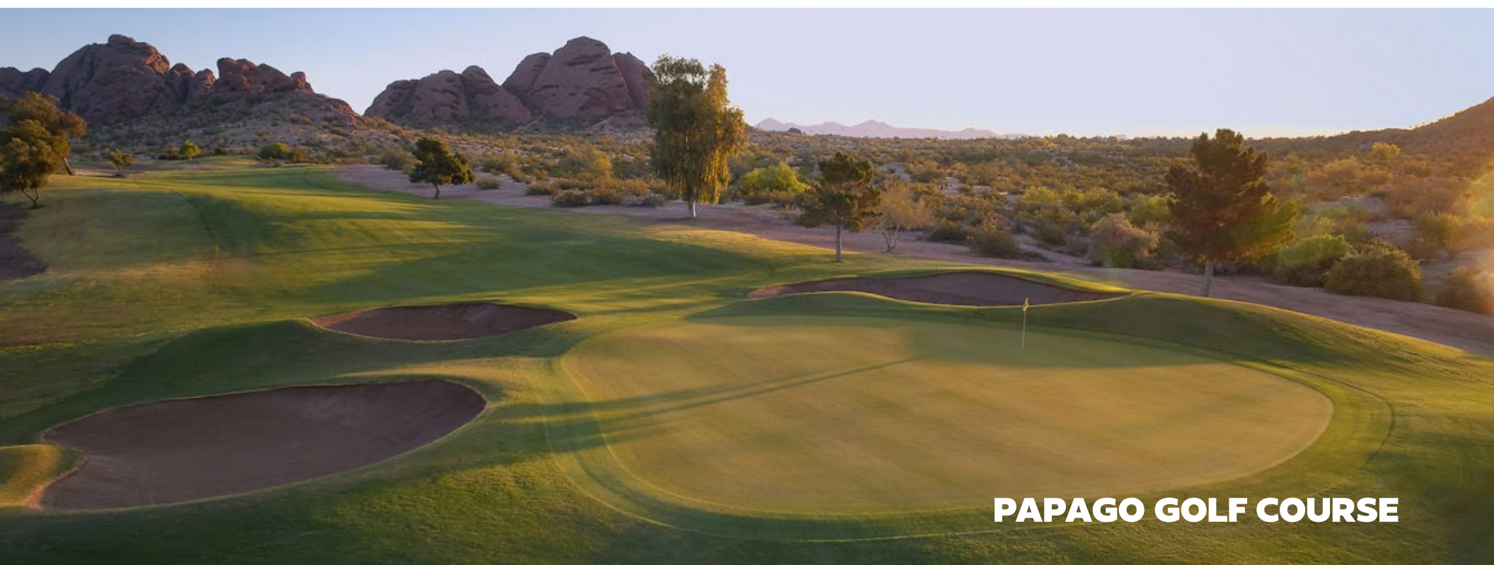
PAPAGO GOLF COURSE