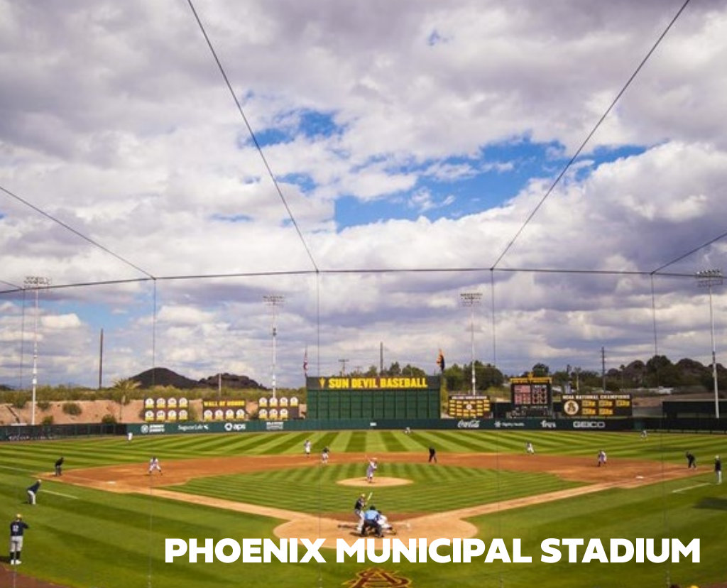
PHOENIX MUNICIPAL STADIUM