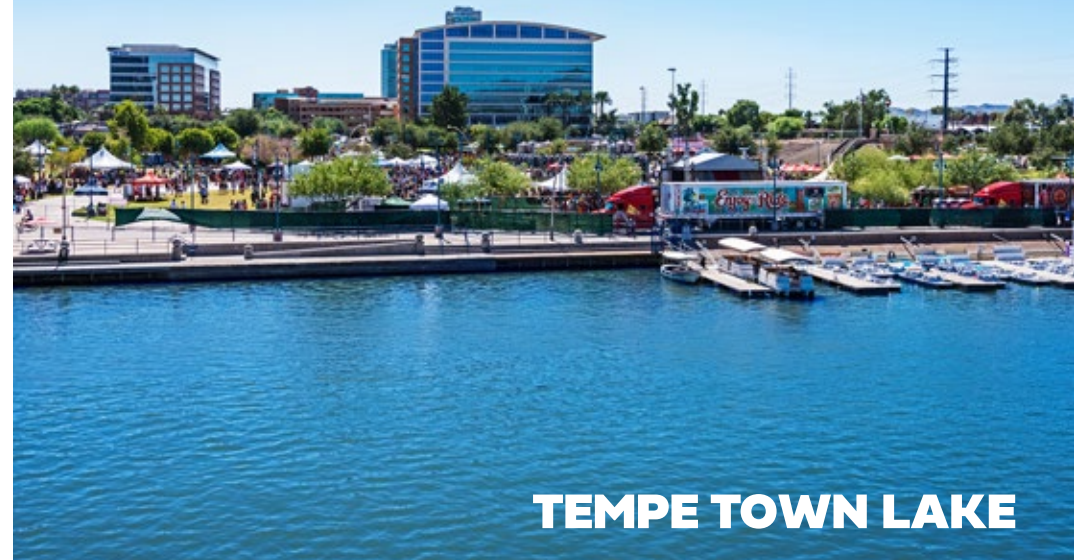
TEMPE TOWN LAKE