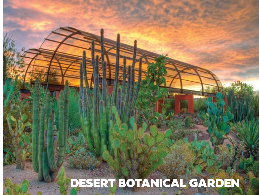
DESERT BOTANICAL GARDEN