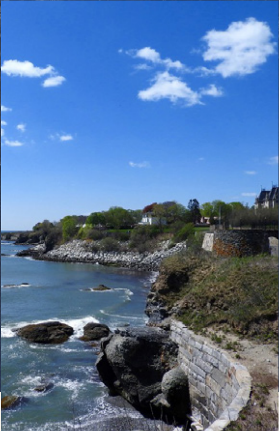
BEACHES AND COASTAL ESCAPES

Newport is host to one of the country’s largest and most prestigious in-water boat shows, showcasing luxury yachts and marine innovation each fall.