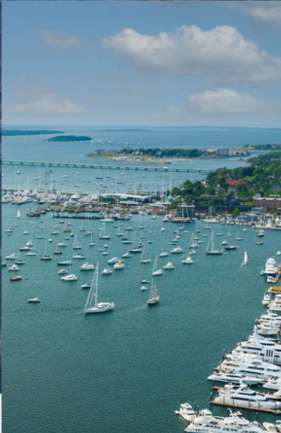
NEWPORT INTERNATIONAL BOAT SHOW

This historic venue celebrates the greatest sports players, with museum exhibits and grass courts open to the public.