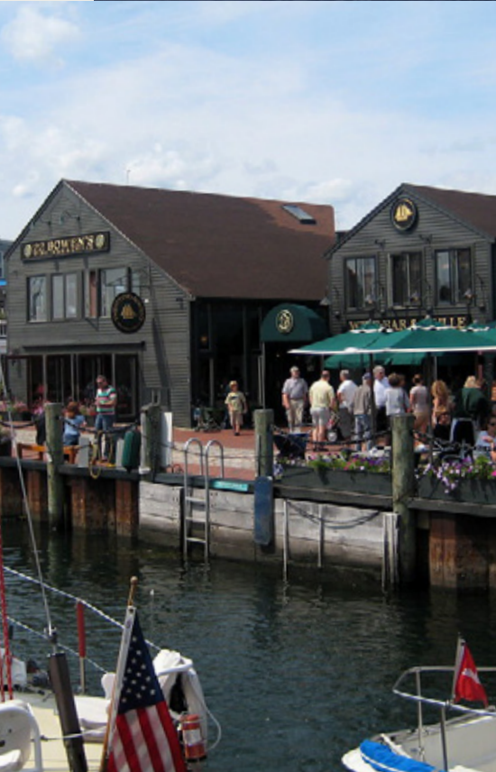
THAMES STREET AND WATERFRONT DISTRICT

Newport is home to architectural landmarks such as The Breakers, Marble House, and Rosecliff which showcase the opulence of Americas Gilded Age and remain among the most visited historic sites in New England.