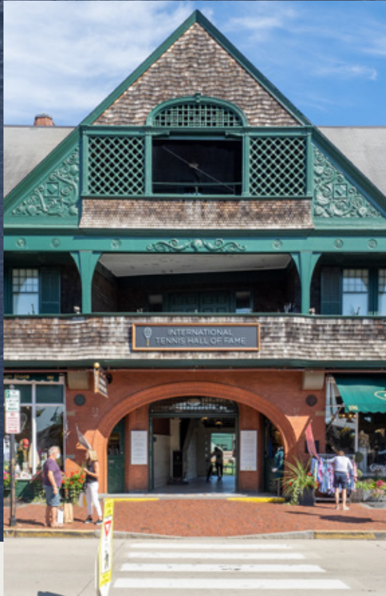
INTERNATIONAL TENNIS HALL OF FAME

Newport is a global sailing hub that has hosted Americas Cup races and continues to attract yachting enthusiasts, private vessels, and luxury charters from around the world.