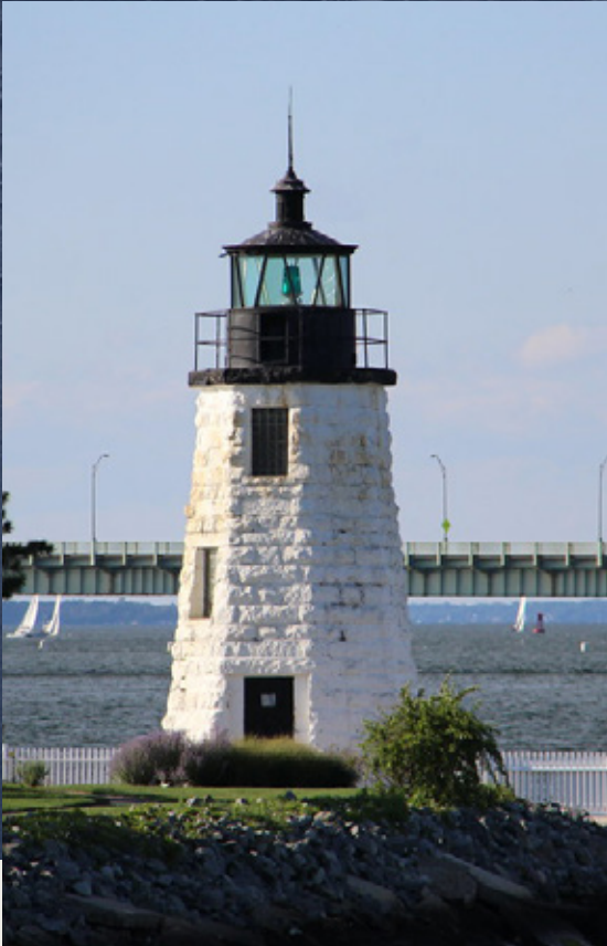
NEWPORT HARBOR AND SAILING CULTURE

This area is the heart of Newport’s shopping, dining, and nightlife scene, featuring boutique shops, art galleries, acclaimed restaurants, and vibrant harbor front bars.