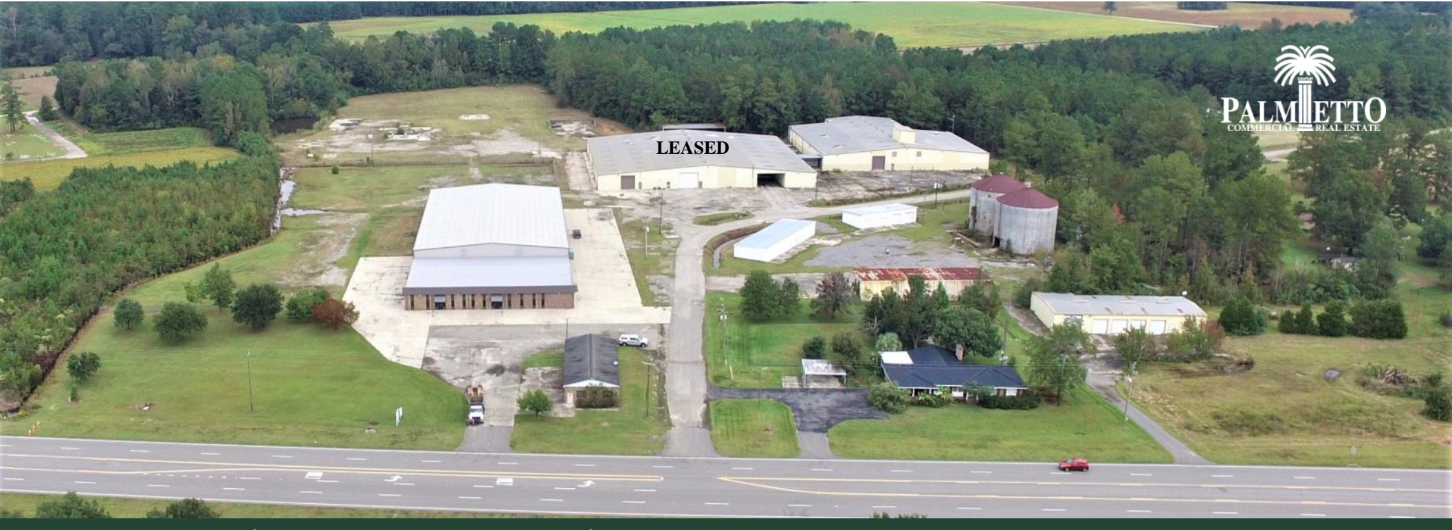
±71,000 Square Feet • ±22 Acres • For Lease • Johnsonville, SC