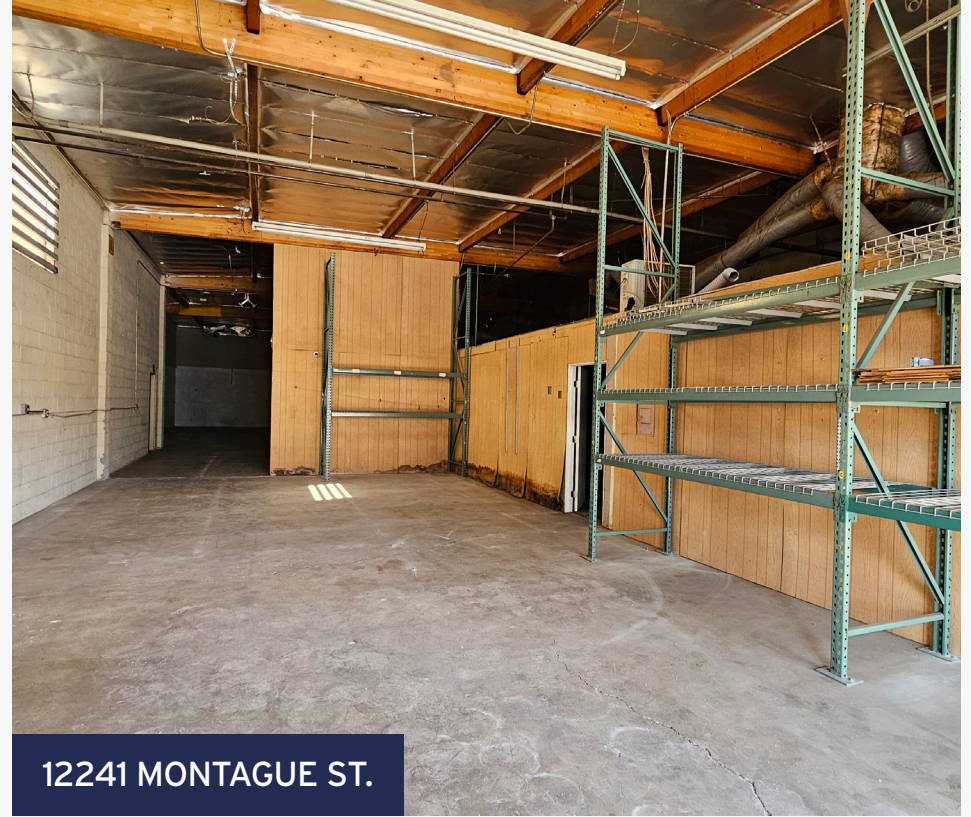
12241 MONTAGUE ST.