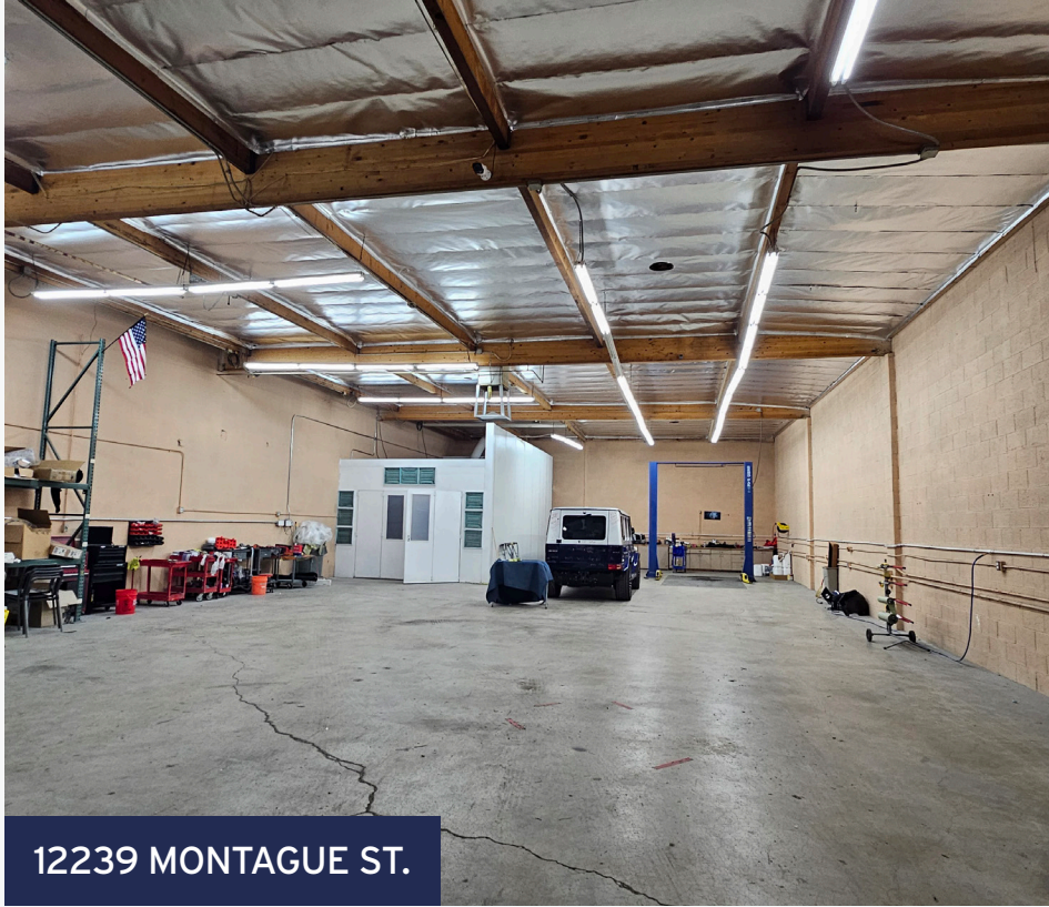
12239 MONTAGUE ST.