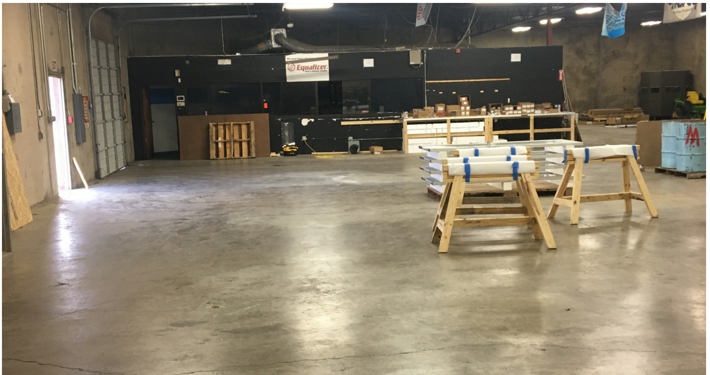
Common Interior View

ELLIS & TINSLEY, INC. COMMERCIAL AND INVESTMENT REAL ESTATE