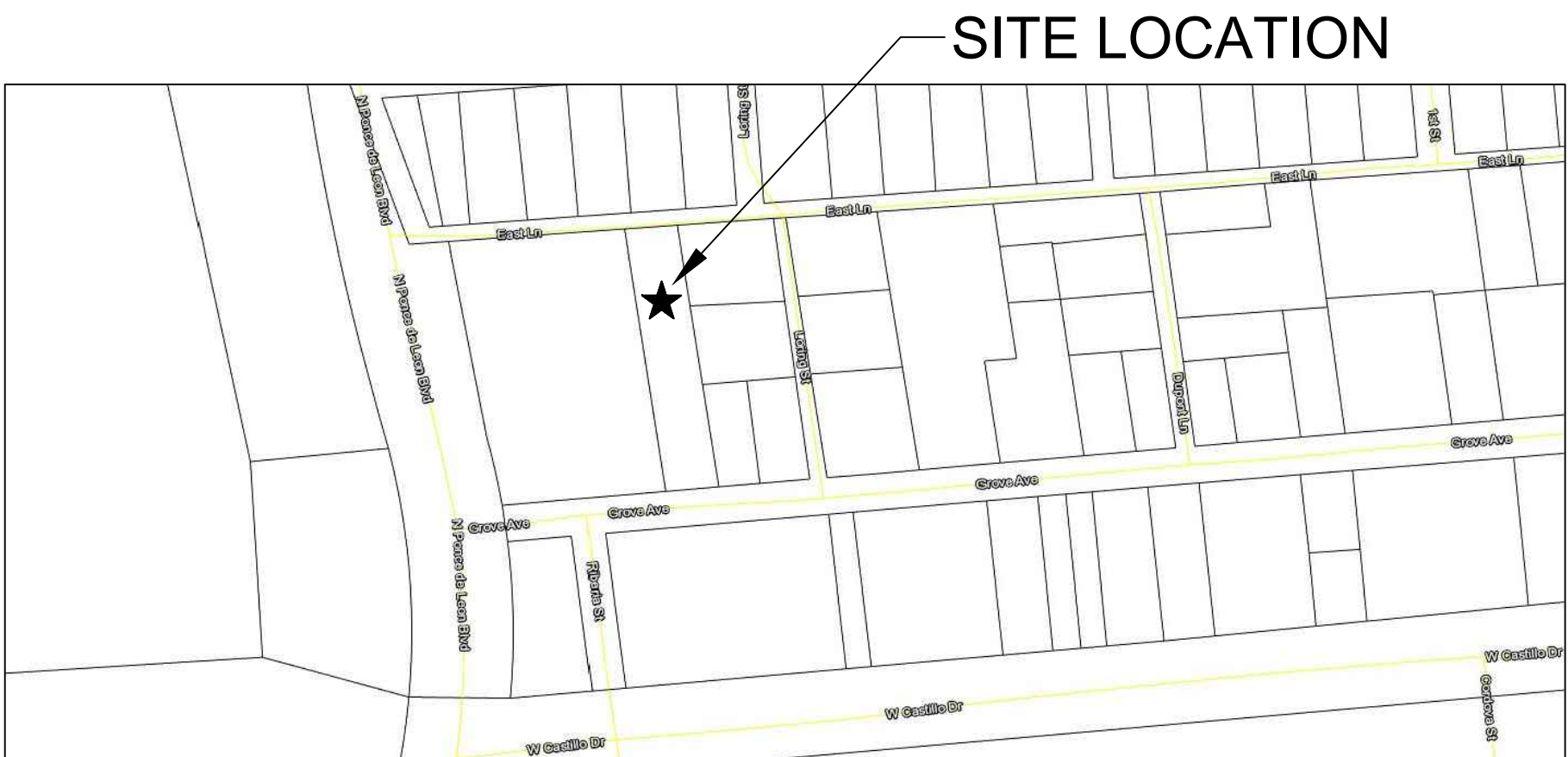
PROJECT LOCATION MAP NTS