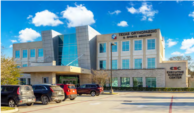
13603 Michel Rd., Tomball, TX