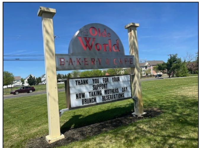
Restaurant across the street