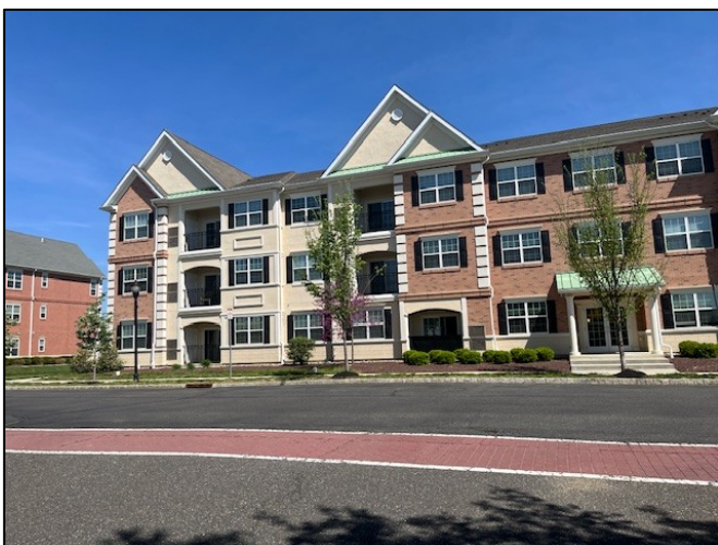
New abutting apartments