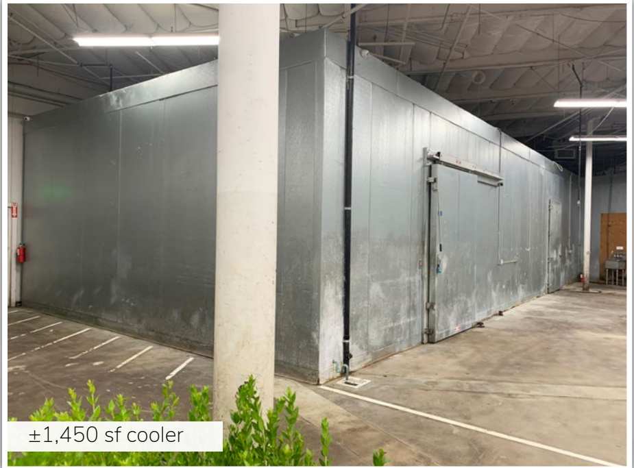
±1,450 sf cooler