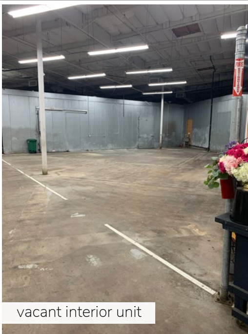
vacant interior unit