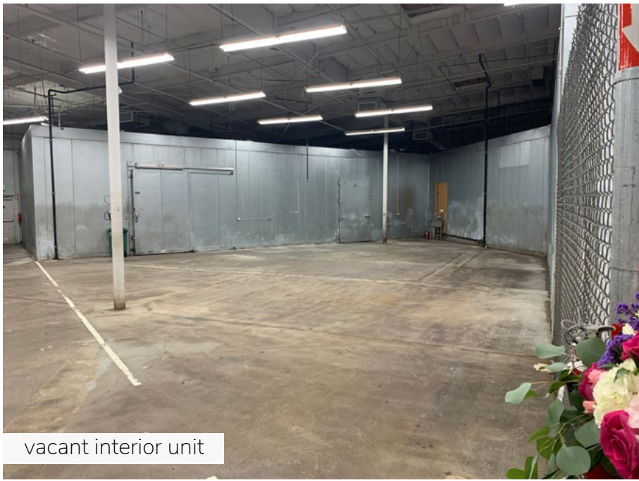
vacant interior unit