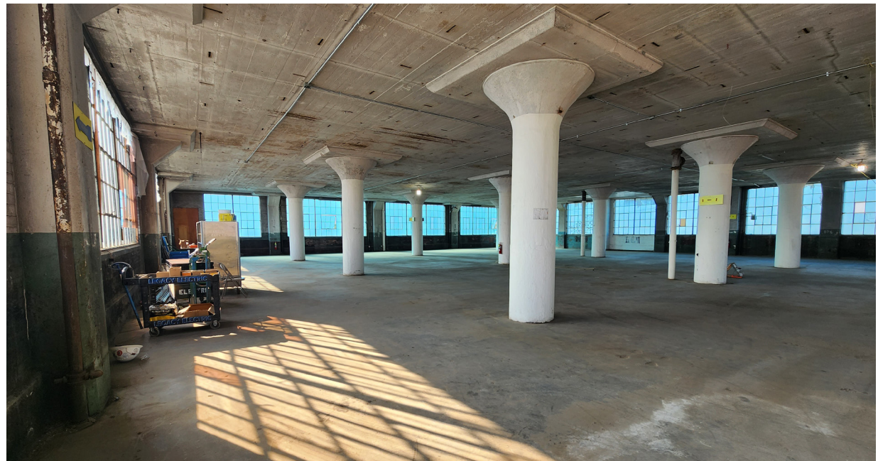
TYPICAL SPACE — OVERSIZED WINDOWS OFFER 360 VIEW OF CLEVELAND