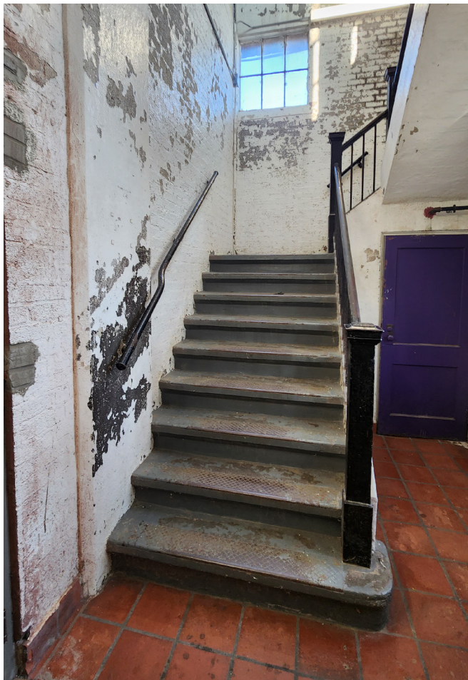
MAIN STAIRWELL TO AVAILABLE FLOORS