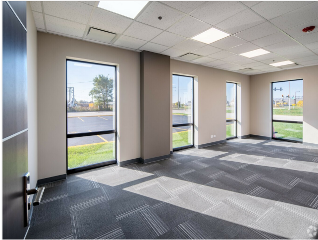
1st Floor Unit 1047

9950 Lawrence Ave, Schiller Park, IL 60176