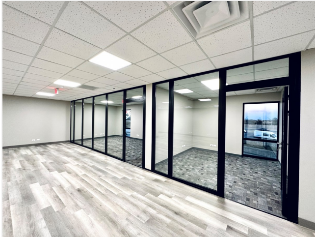
4th Floor 4825 Scott

Space Available 3,234 SF Rental Rate $20.00 /SF/YR Date Available Now Service Type Full Service Built Out As Standard Office Space Type Relet Space Use Office Lease Term Negotiable