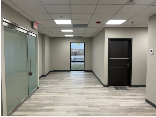
1st floor Unit 104

9950 Lawrence Ave, Schiller Park, IL 60176