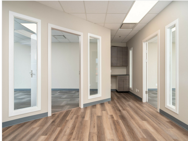
3rd Floor Unit 308

Two private offices with large windows, reception area and a closet. In all units there's an option to modify a space: add a kitchenette, private restroom, add or remove a wall. Units can also be combined with the adjacent ones.