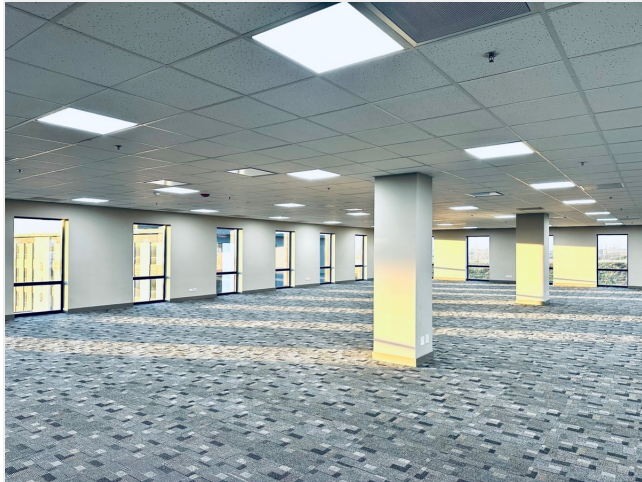
4th Floor 4825 Scott

Large open space with option for multiple private office with either traditional or glass walls. Partially finished with option to modify according to your needs. Could be used for catering since it has a space prepared for kitchen equipment.