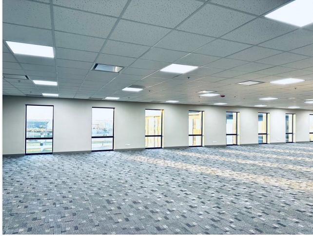
4th Floor 4825 Scott

9950 Lawrence Ave, Schiller Park, IL 60176