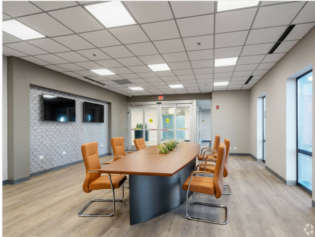
107 Conference Room