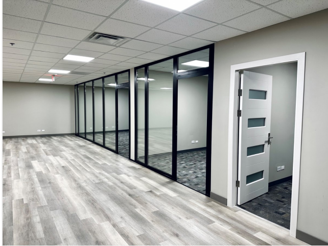
4th Floor 4825 Scott

9950 Lawrence Ave, Schiller Park, IL 60176