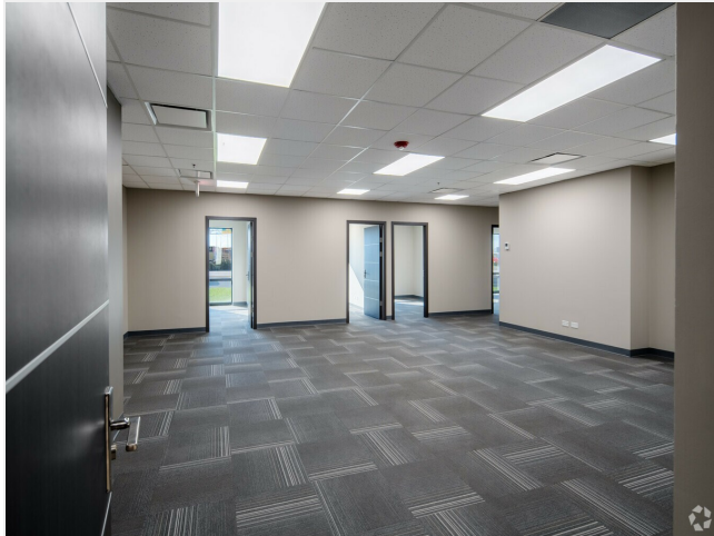
1st Floor Unit 1047