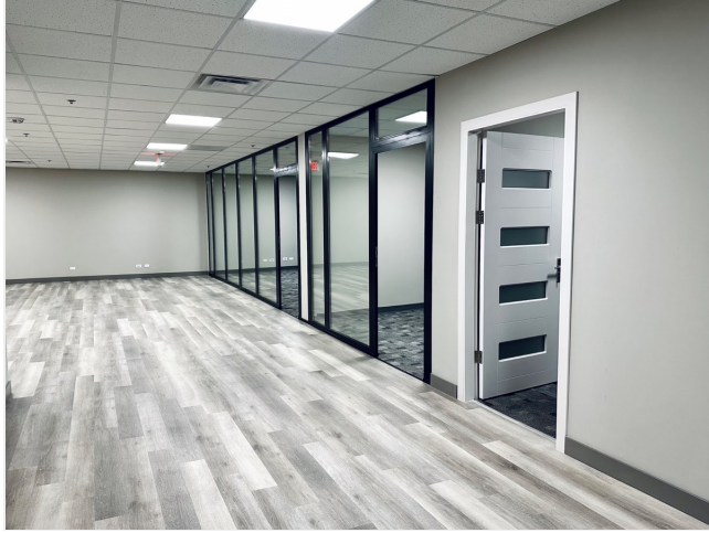
4th Floor 4825 Scott

9950 Lawrence Ave, Schiller Park, IL 60176