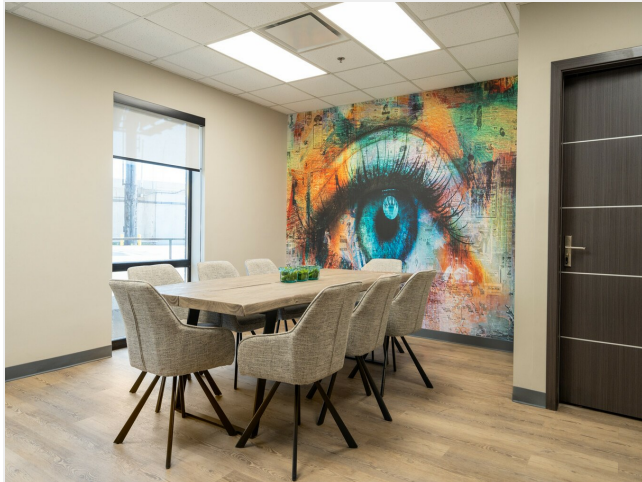
Conference Room Unit 107

6 private offices, one can be turn into kitchenette.