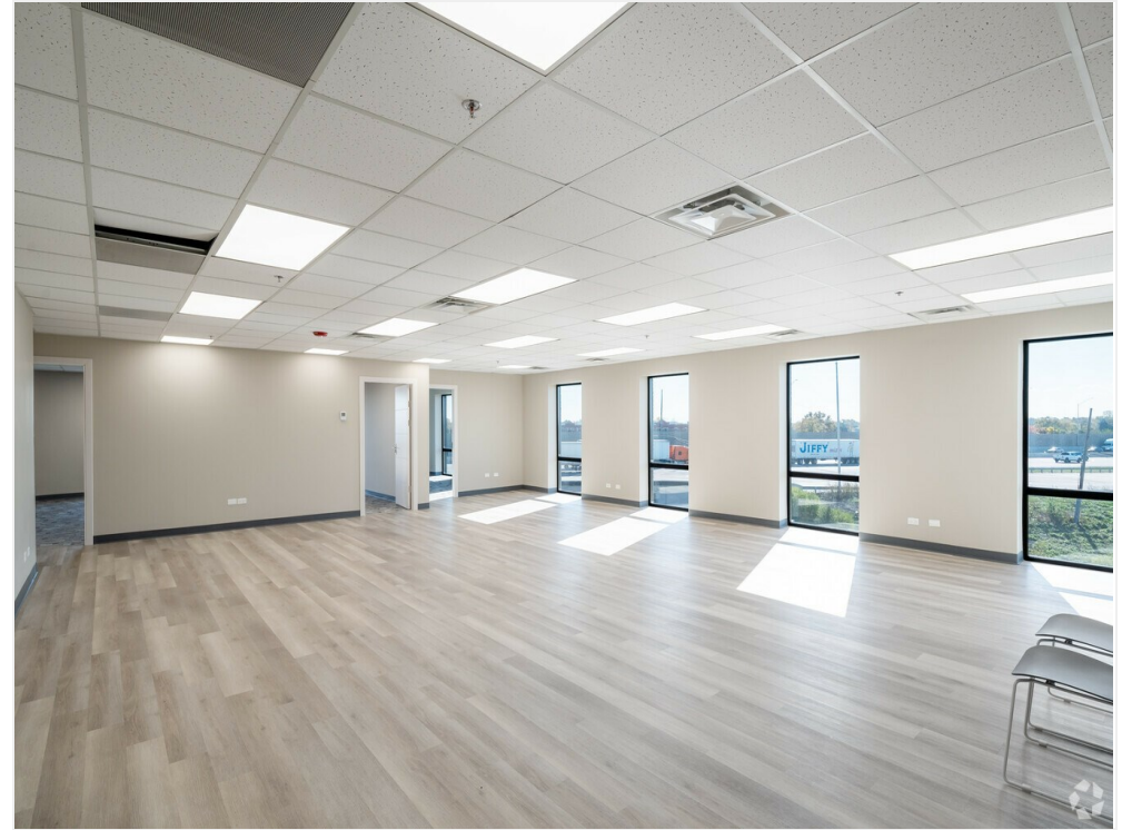
3rd Floor Unit 301