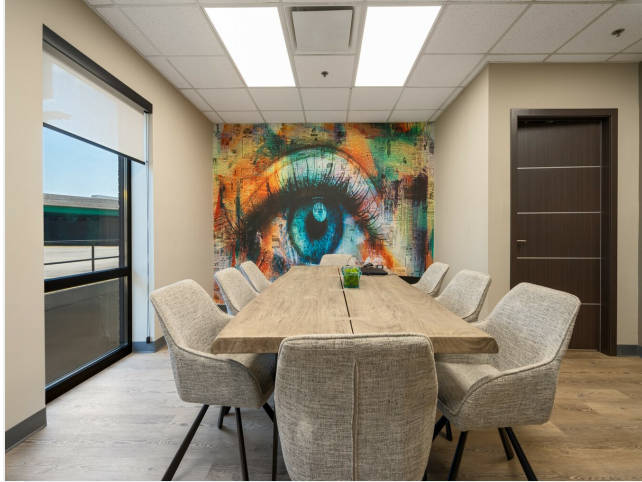
Conference Room Unit 107

9950 Lawrence Ave, Schiller Park, IL 60176