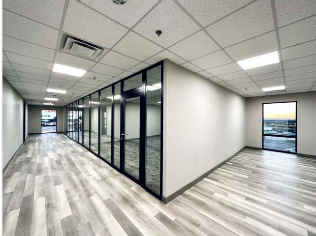
4th Floor 4825 Scott

Space Available 676 SF Rental Rate $20.00 /SF/YR Date Available January 29, 2024 Service Type Full Service Space Type Relet Space Use Office Lease Term Negotiable