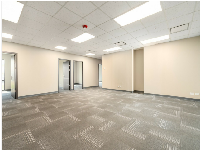
1st Floor Unit 104

Large open space with private office. In all units there's an option to modify a space: add a kitchenette, private restroom, add or remove a wall.