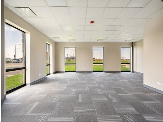
1st Floor Unit 104

9950 Lawrence Ave, Schiller Park, IL 60176