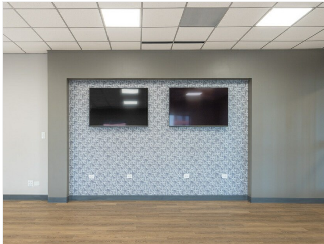
Conference Room Unit 107