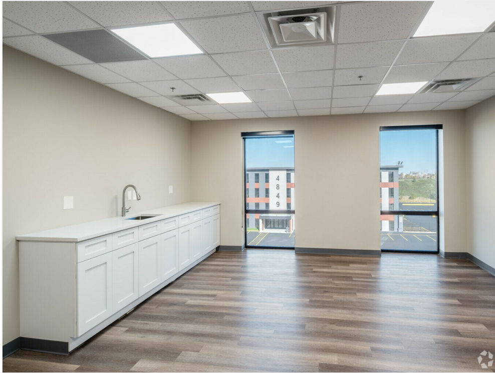
Break Room 406