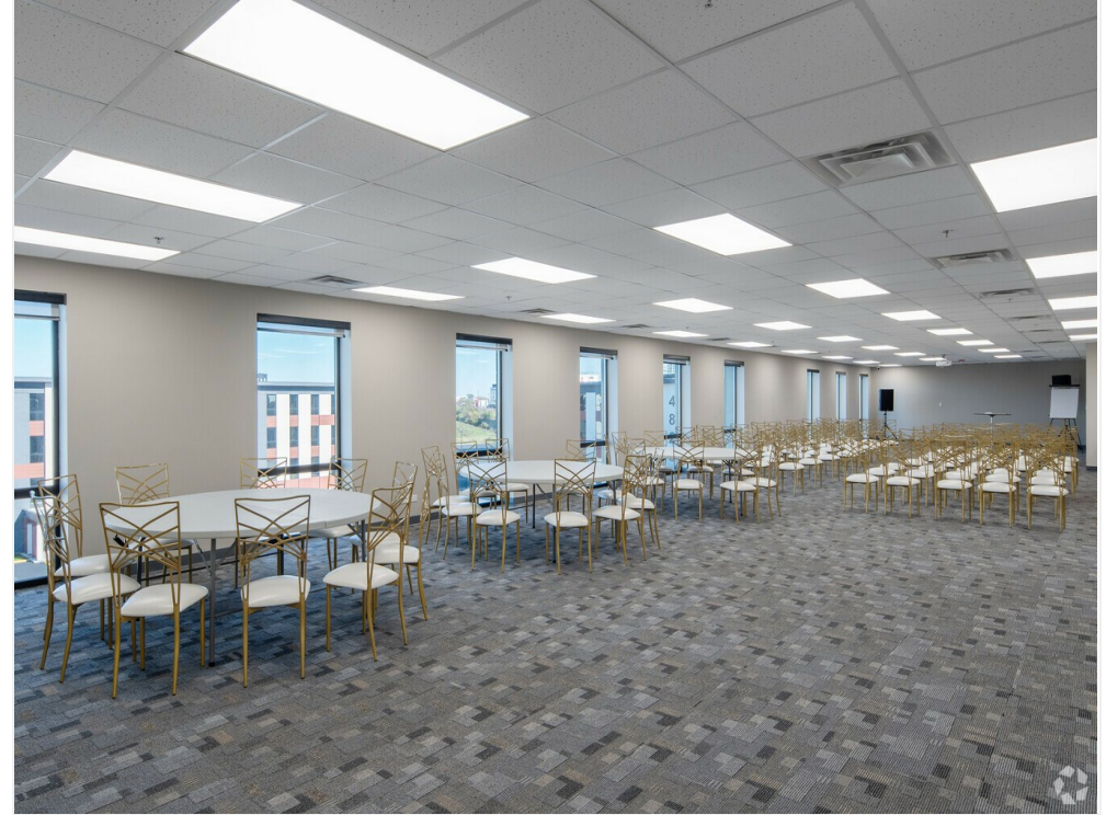
4th Floor Unit 405