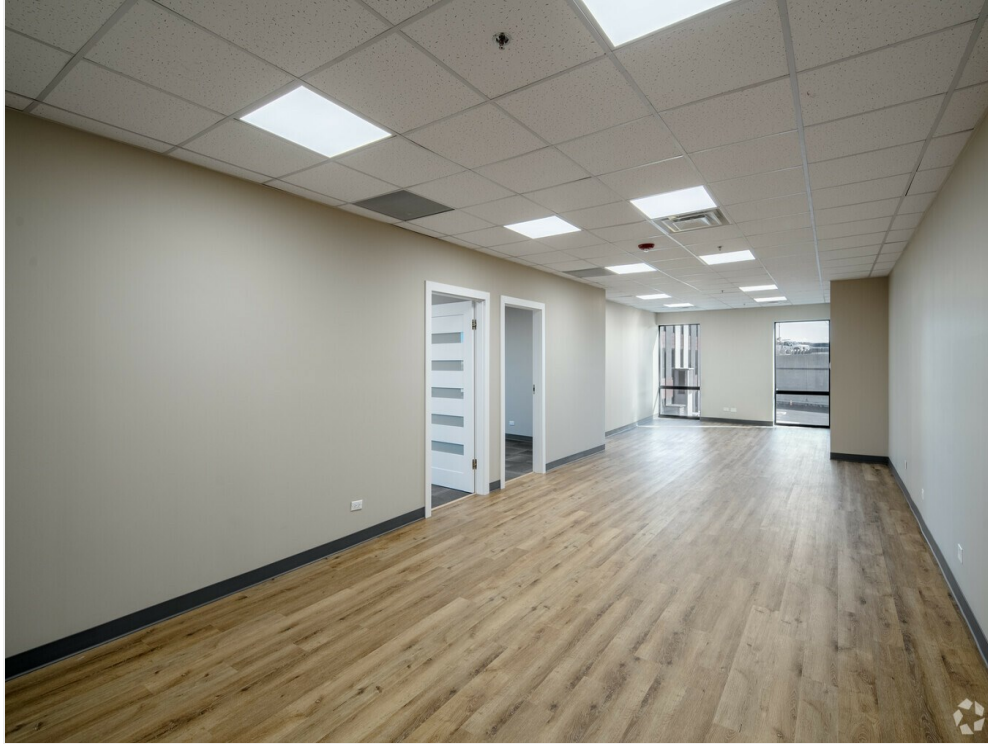
2nd Floor Unit 208