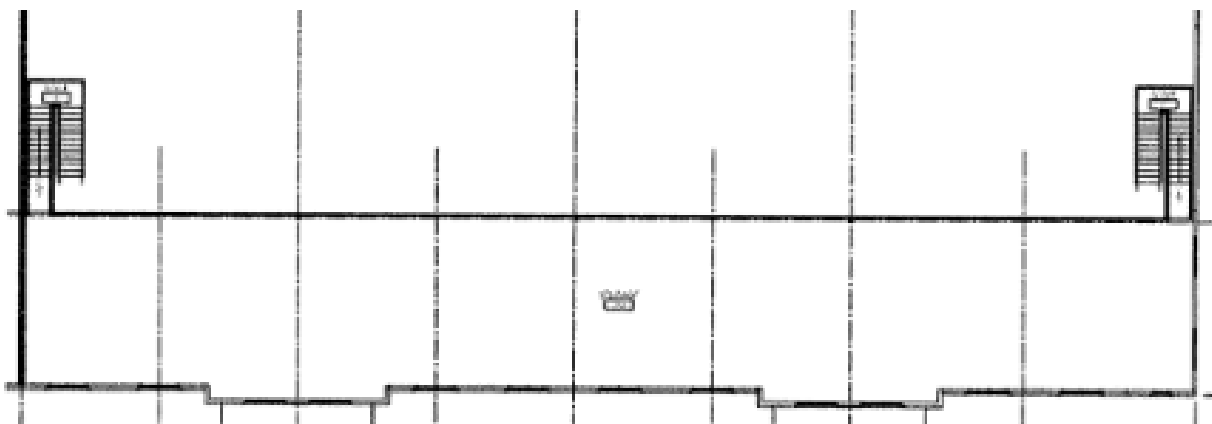
LOAD BEARING WAREHOUSE MEZZANINE ABOVE OFFICES