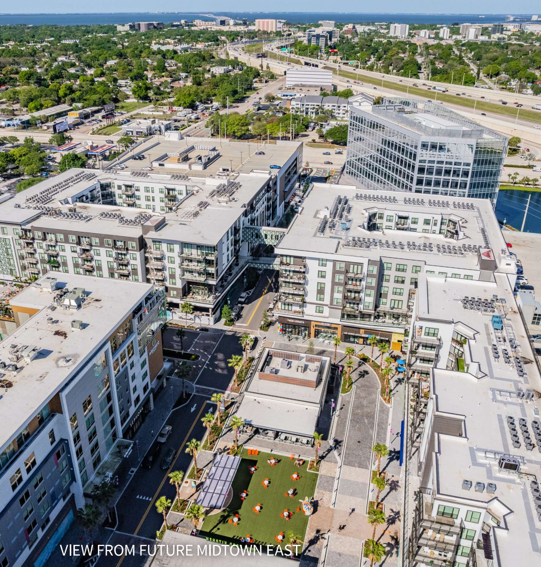
VIEW FROM FUTURE MIDTOWN EAST