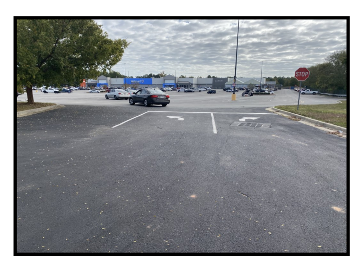
Ingress/Egress 2 out of parking lot