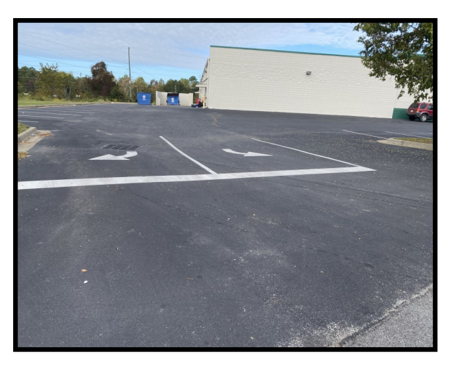
Ingress/Egress 2 into parking lot