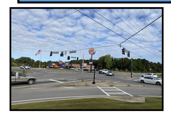
Main Intersection and Drive