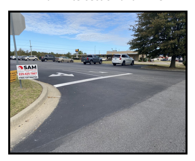
Ingress/Egress 1 into parking lot