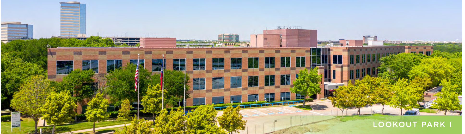
LOOKOUT PARK I