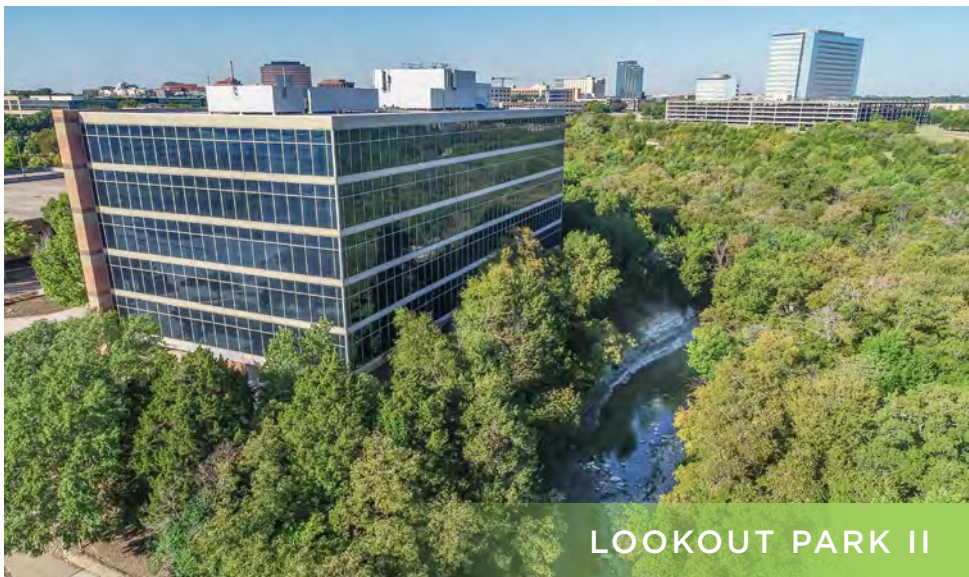
LOOKOUT PARK II