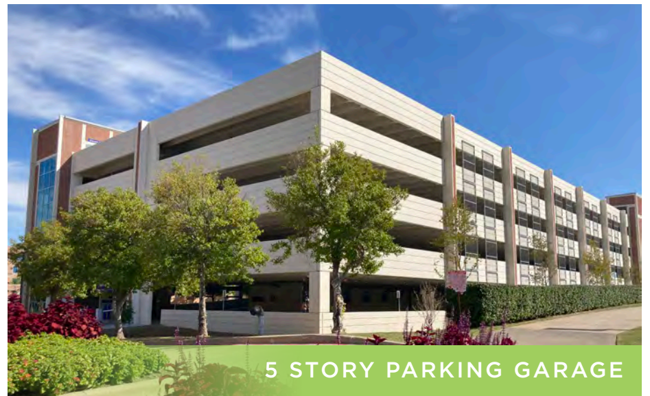
5 STORY PARKING GARAGE