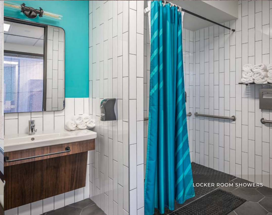
LOCKER ROOM SHOWERS