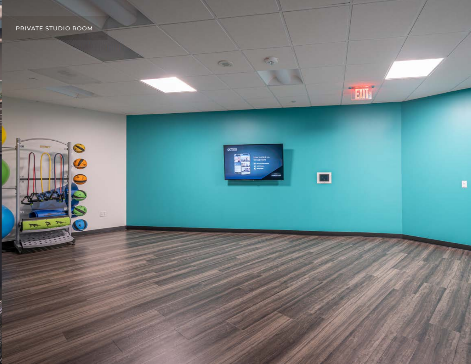
PRIVATE STUDIO ROOM