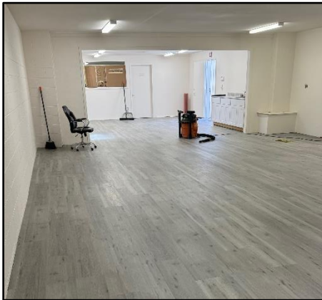
Wide Open Space