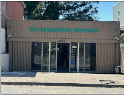
Secured Glass Front