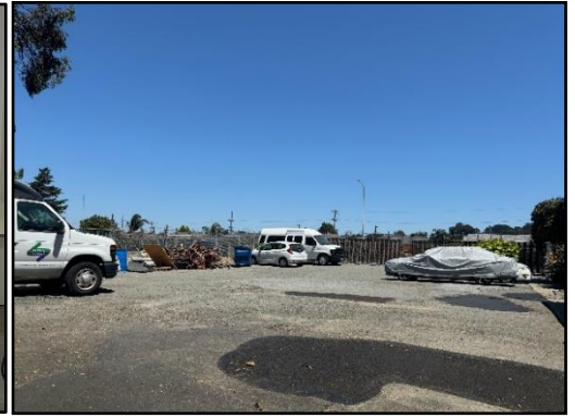
Large Fence Yard