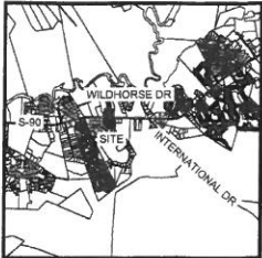
VICINITY MAP - NOT TO SCALE