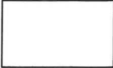
APPROVAL OF RECORDATION