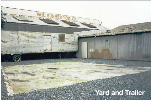
Yard and Trailer