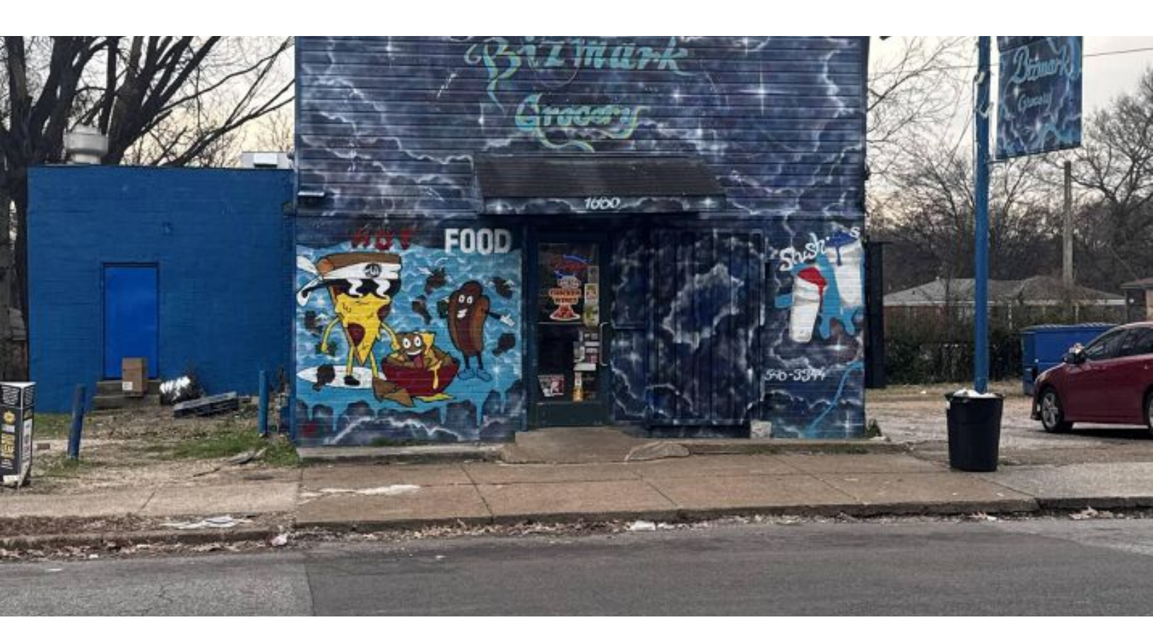
271 W Person Ave, Memphis, TN 38109