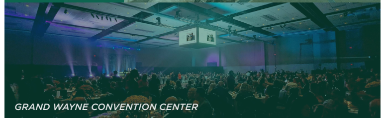
GRAND WAYNE CONVENTION CENTER