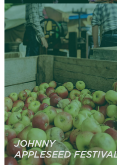
JOHNNY APPLESEED FESTIVAL