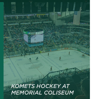
KOMET'S HOCKEY AT MEMORIAL COLISEUM