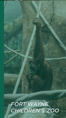
FORT WAYNE CHILDREN'S ZOO

#1 Best Place to Move (Reader's Digest, 2022)