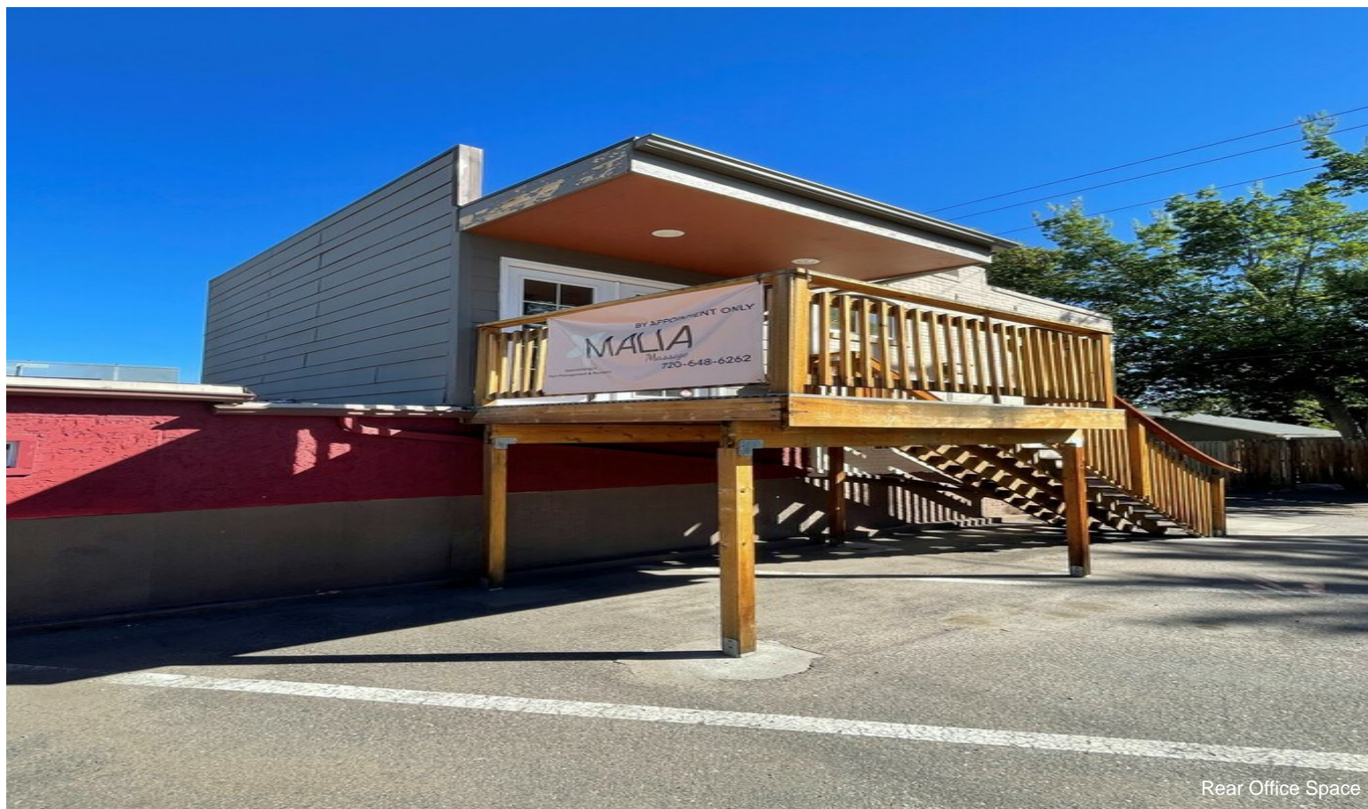
Rear Office Space