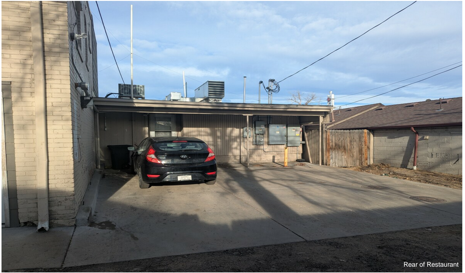
Rear of Restaurant