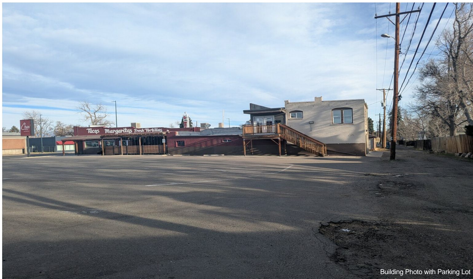
Building Photo with Parking Lot