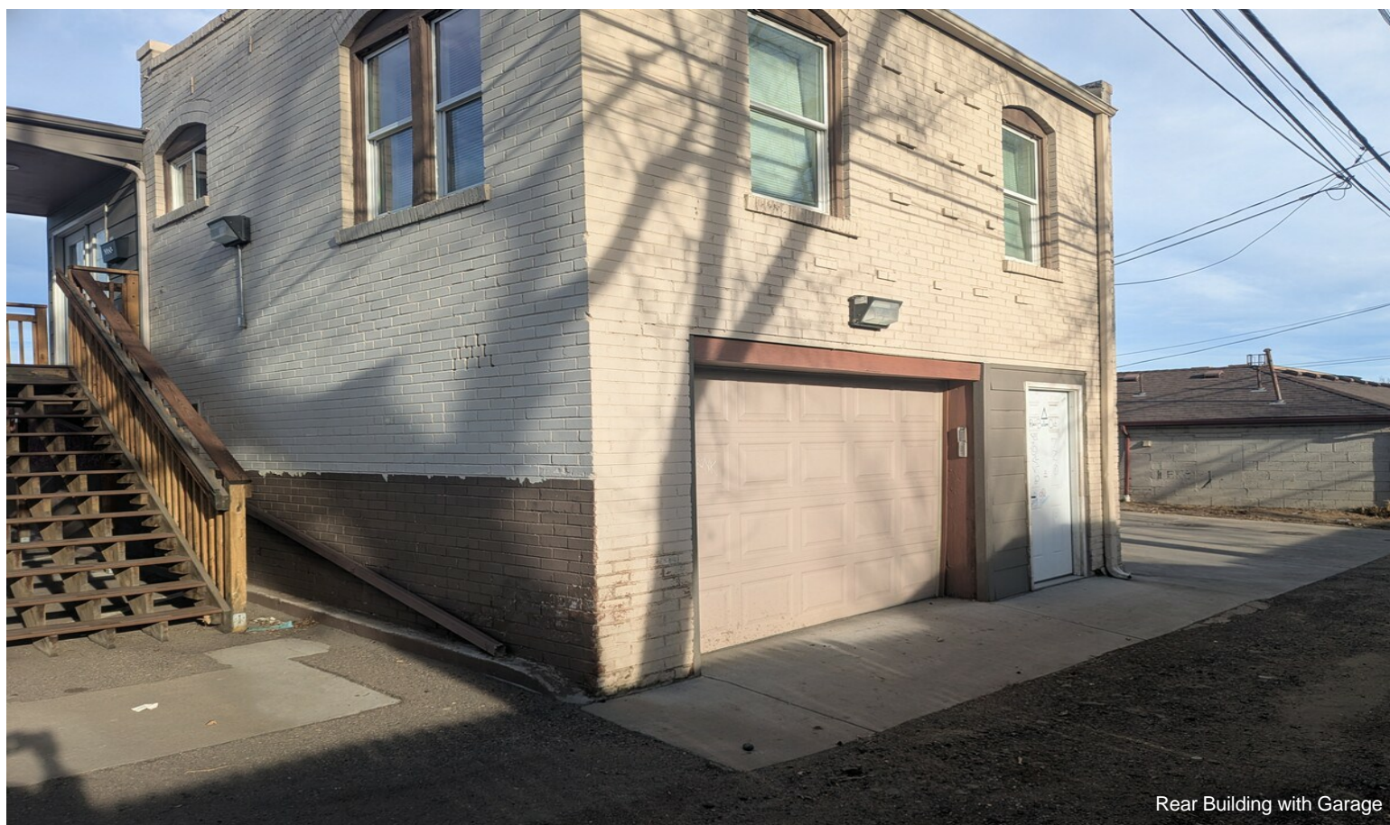
Rear Building with Garage