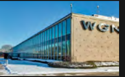
07 WGN CAMPUS