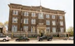
44 CROWN ARTS, MINNEAPOLIS