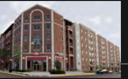
08 CHAUNCEY SQUARE