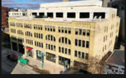
51 THE TANNERY, MILWAUKEE (TRADE CENTER BUILDING)