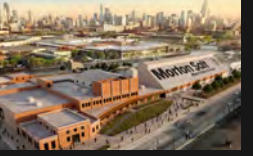
47 SALT DISTRICT