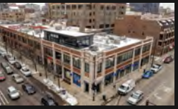
28 800 WEST WASHINGTON