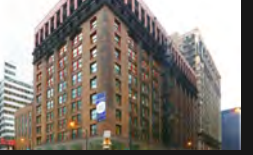
39 79 WEST MONROE