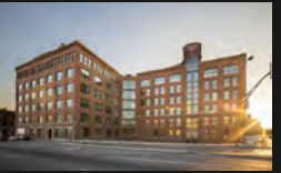
05 770 NORTH HALSTED