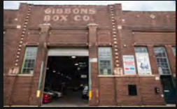
18 1210 WEST LAKE