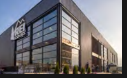
54 1422 KINGSBURY (FLAGSHIP REI)