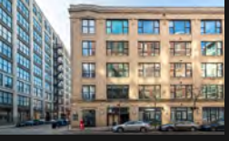
36 901 WEST JACKSON