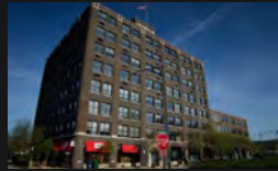
01 900 NORTH FRANKLIN