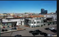
14 1200 NORTH BRANCH