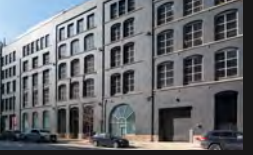
38 130 SOUTH JEFFERSON