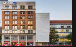
32 JP MORGAN CHASE - LOUISVILLE