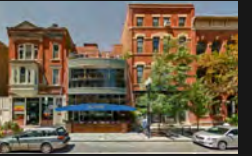
24 1262 NORTH WELLS