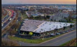
26 7855 GROSS POINT ROAD