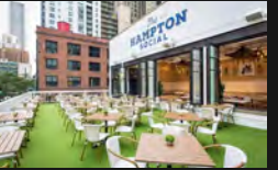
30 164 EAST GRAND