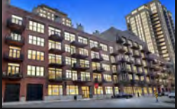
27 375 WEST ERIE