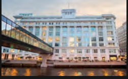
43 ASO CENTER