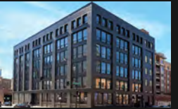
06 224 NORTH DESPLAINES