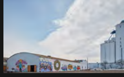
49 1325 QUINCY, MINNEAPOLIS (QUINCY HALL BUILDING)