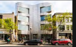
23 855 BELMONT