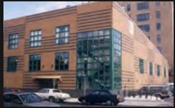
02 19 NORTH SANGAMON