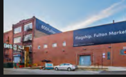
33 800/810 WEST FULTON