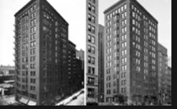
37 542 SOUTH DEARBORN