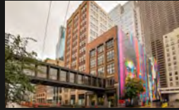
17 THE 15 BUILDING