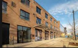
25 1400 KINGSBURY