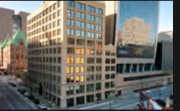
22 FLOUR EXCHANGE BUILDING