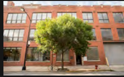
09 1110 WEST MONROE