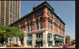
15 GERMANIA PLACE