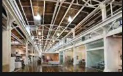
50 1325 QUINCY, MINNEAPOLIS (CRANE BAY BUILDING)