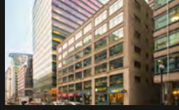
41 118 SOUTH CLINTON