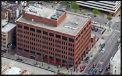
11 1185 NORTH CLARK