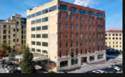
52 THE TANNERY, MILWAUKEE (ATLAS BUILDING)