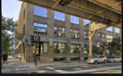
35 640 WEST LAKE