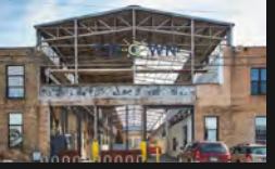
45 CROWN ARTS, MINNEAPOLIS