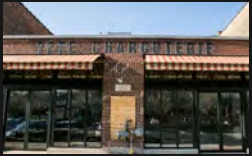
03 1114 WEST RANDOLPH