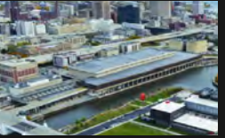
21 MILWAUKEE POST OFFICE