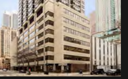
40 40-50 EAST HURON