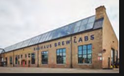
46 CROWN ARTS, MINNEAPOLIS