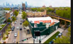
29 1760 NORTH MILWAUKEE