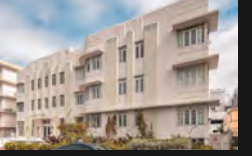
48 ALDEN HOTEL - MIAMI BEACH