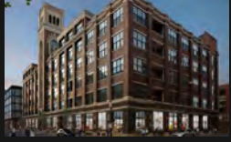
42 1000 WEST WASHINGTON