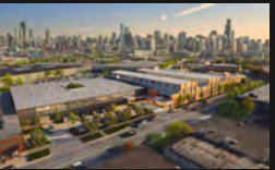
20 1315 NORTH BRANCH