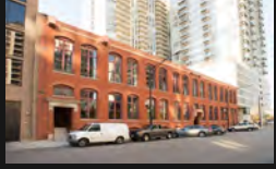
34 445 WEST ERIE