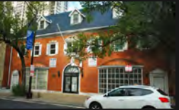
04 1221 NORTH LASALLE