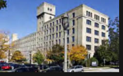
53 THE TANNERY, MILWAUKEE (TIMBERS BUILDINGS)