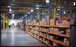
19 2059 WEST HASTINGS