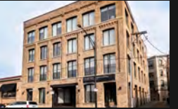
31 2001 NORTH CLYBOURN