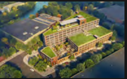
12 1001 NORTH BRANCH