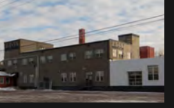
56 CROWN ARTS, MINNEAPOLIS