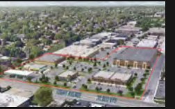
16 SKOKIE TOUHY DEVELOPMENT