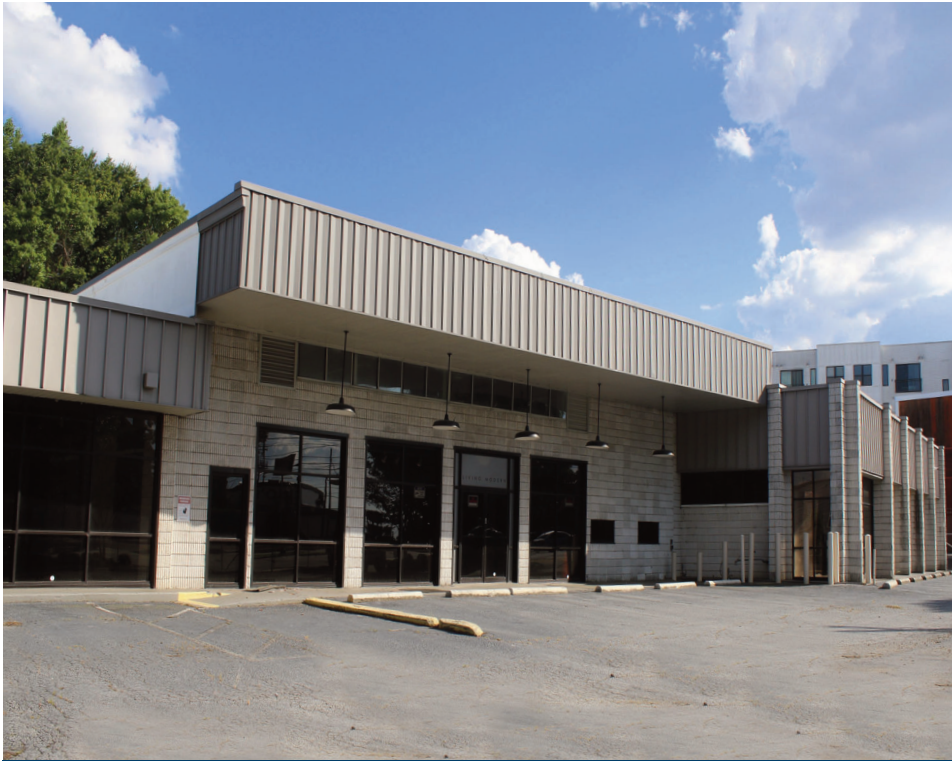
1747 Cheshire Bridge Road | Atlanta, Georgia 30324

HIGH TRAFFIC RETAIL CORRIDOR $7,250,000 OR $23.00 /SF NNN