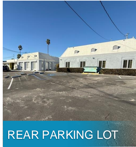
REAR PARKING LOT