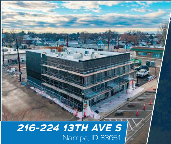
216-224 13TH AVE S Nampa, ID 83651

THIS PROPERTY OFFERS PRIVATE ON-SITE PARKING.