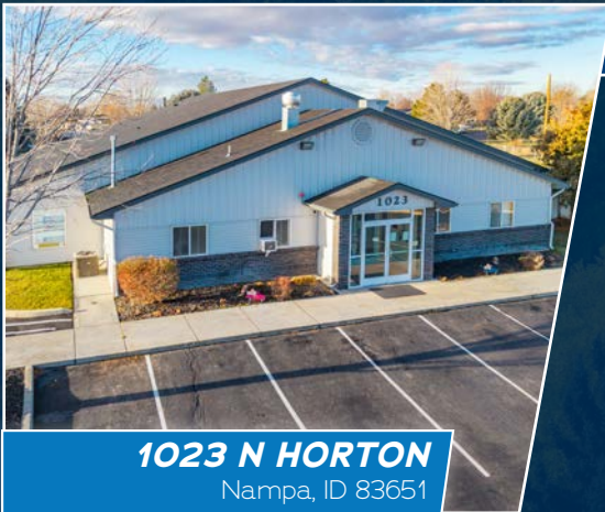
1023 N HORTON Nampa, ID 83651

THIS PROPERTY OFFERS PRIVATE ON-SITE PARKING.