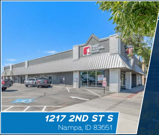
1217 2ND ST S Nampa, ID 83651