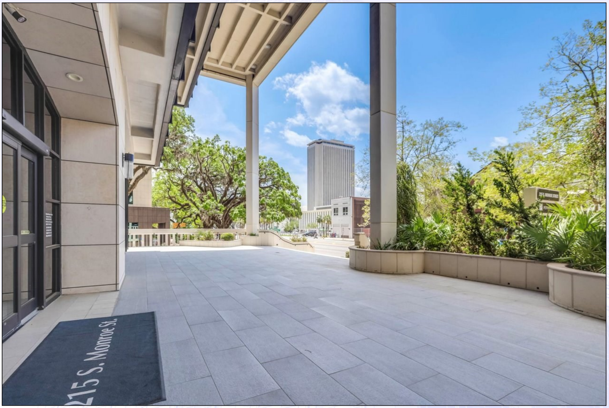
Building Entrance (Florida Capitol Complex in View)