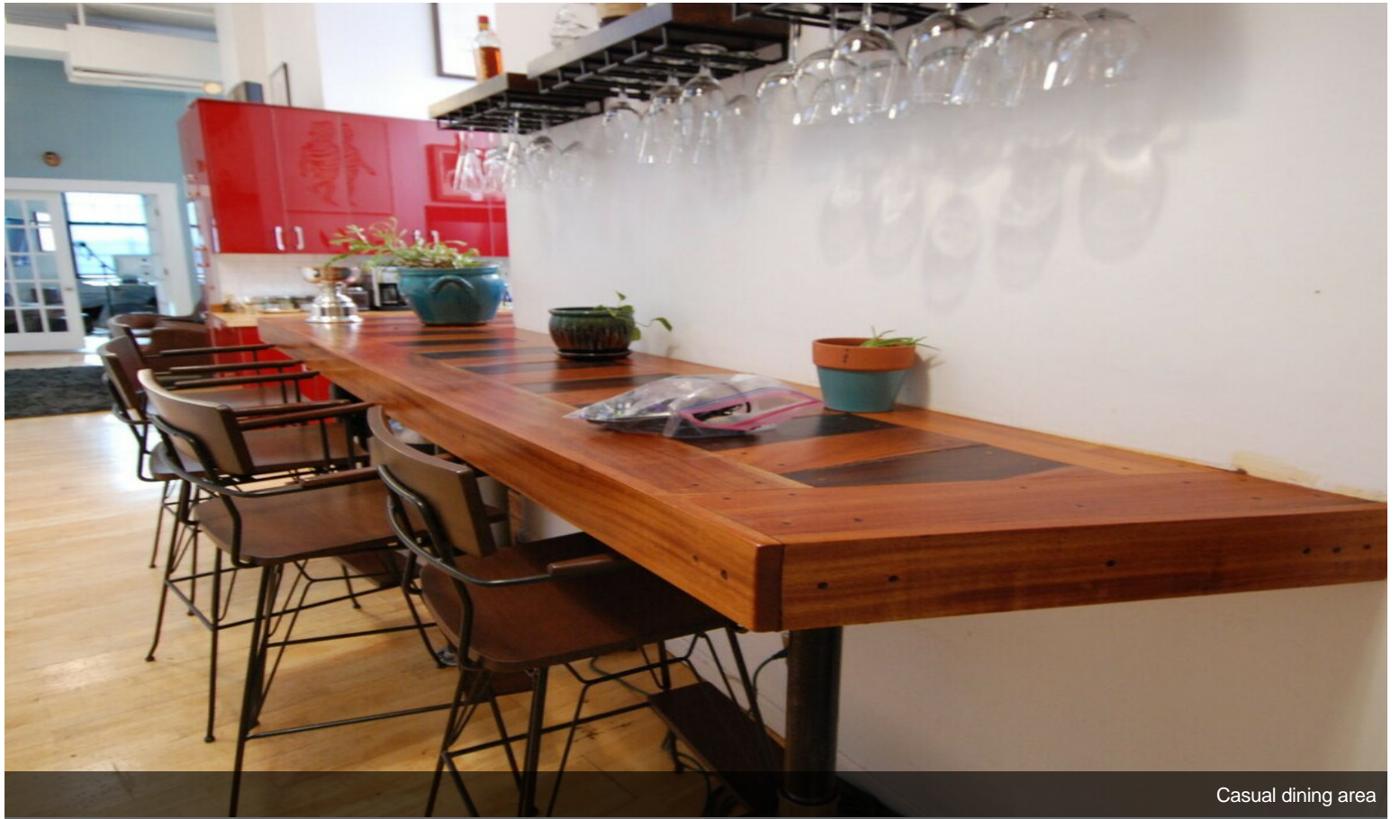
Casual dining area