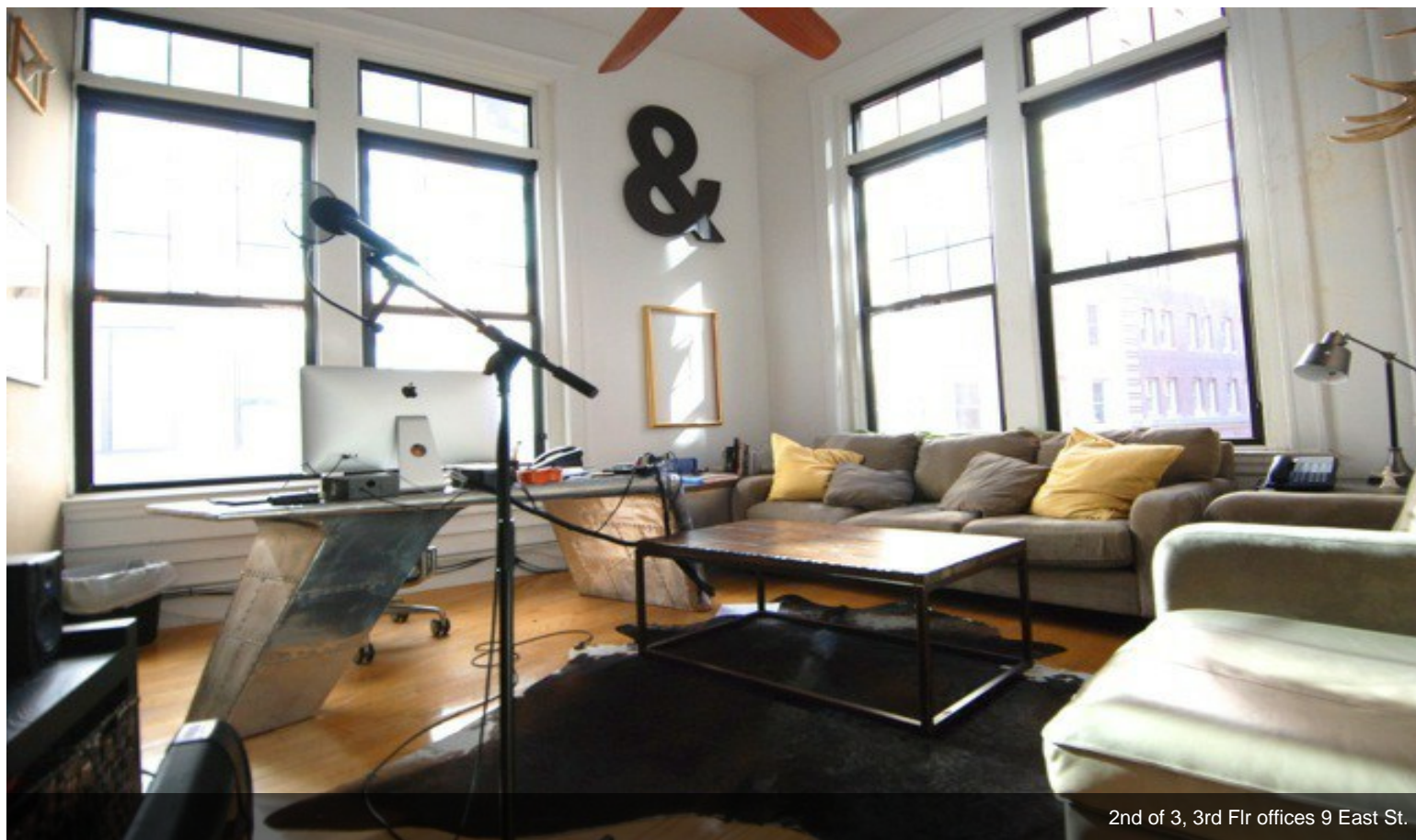
2nd of 3, 3rd Flr offices 9 East St.