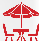
SHARED OUTDOOR COVERED PATIO