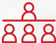
SHARED CONFERENCE FACILITY AND KITCHEN