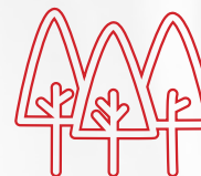
ADJACENT TO GREEN SPACE WITH PROGRAMMED ACTIVITIES