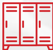
SHOWERS AND LOCKERS