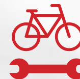
BIKE STORAGE WITH REPAIR FACILITY