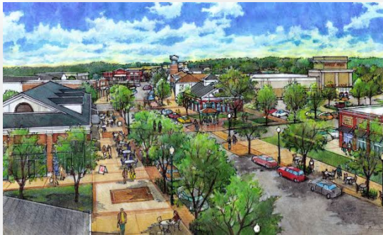
Artist's rendition of Oxford Commons when it's complete.

Premier Community Living with 1,189 planned and existing new homes. Consisting of 214 condos, 200 apartments, 464 townhomes and 775 single-family homes.