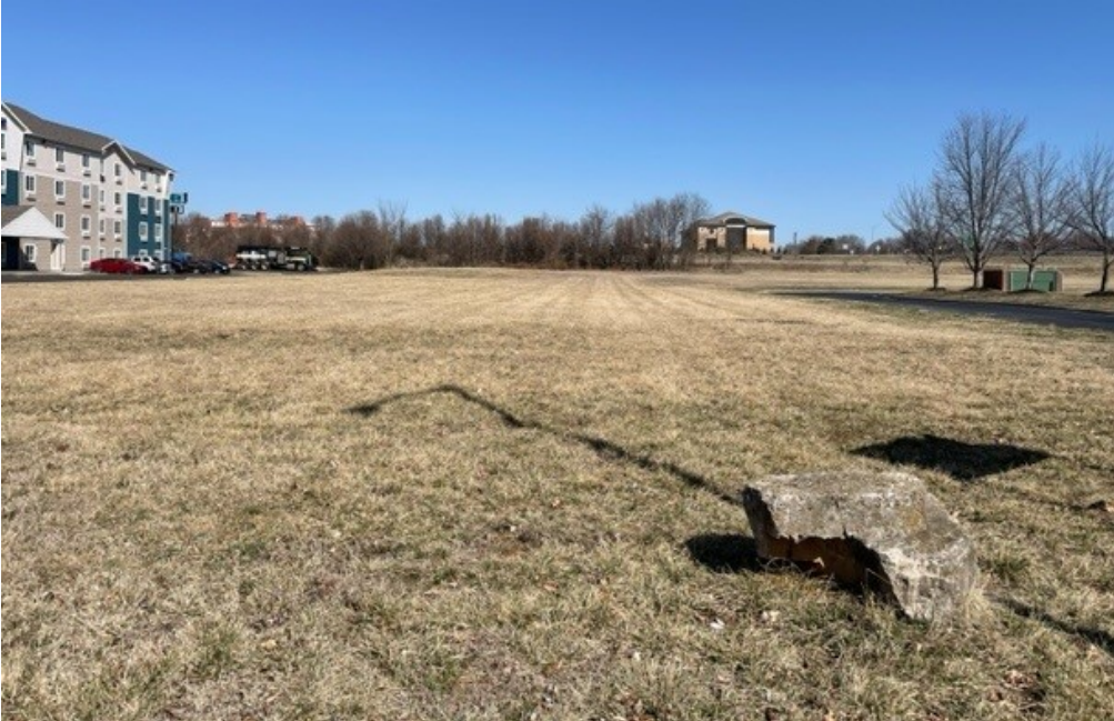
2021 W Kingsley, Springfield, Mo