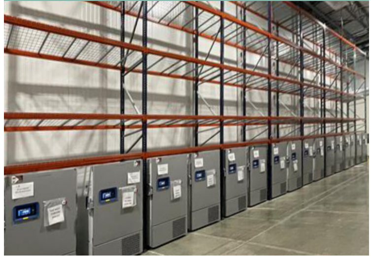
STORAGE WITH UPRIGHT FREEZERS