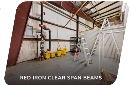
RED IRON CLEAR SPAN BEAMS