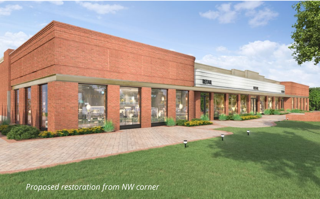
Proposed restoration from NW corner