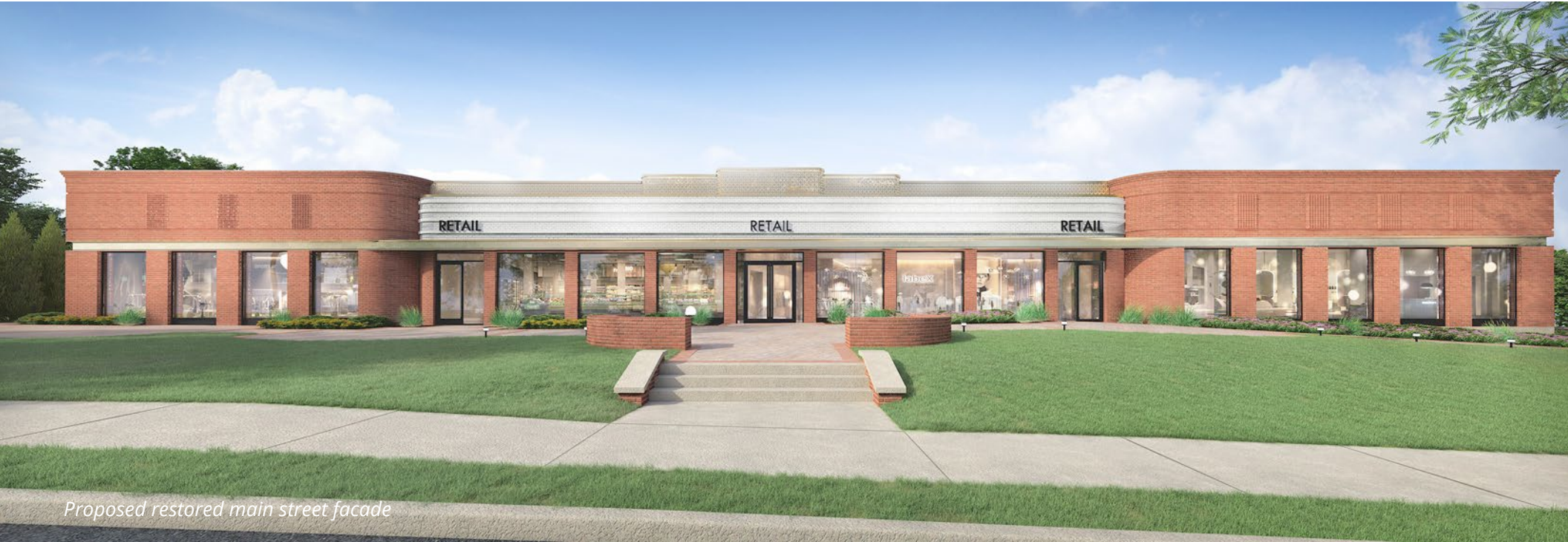
Proposed restored main street facade