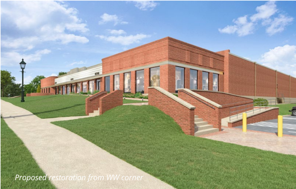
Proposed restoration from WW corner