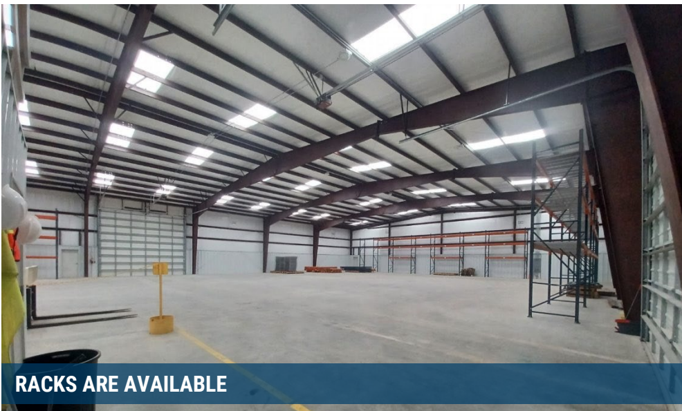
RACKS ARE AVAILABLE