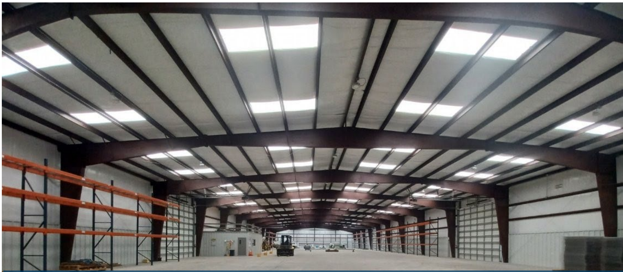
RACKS ARE AVAILABLE