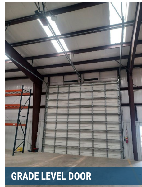
GRADE LEVEL DOOR