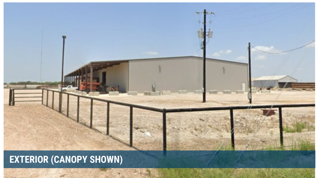
EXTERIOR (CANOPY SHOWN)

236 INDUSTRIAL PARK DR VICTORIA, TEXAS 77905