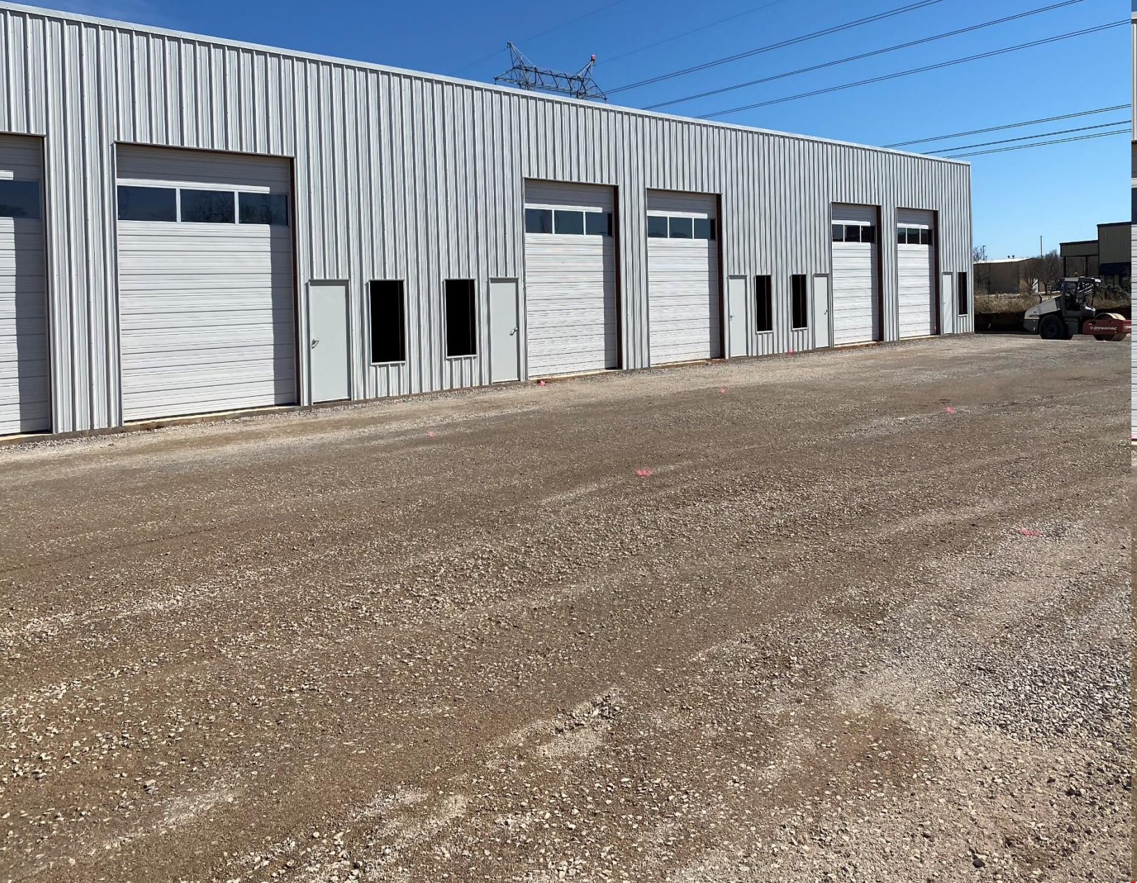
Building C Front of warehouse